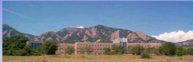
David Skaggs Research Center -- Boulder, Colorado, USA

U.S. Department of Commerce National Oceanic and Atmospheric Administration National Environmental Satellite, Data & Information Service National Geophysical Data Center