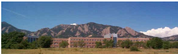
David Skaggs Research Center, Boulder, Colorado, USA

US Department of Commerce National Oceanic & Atmospheric Administration (NOAA) National Environmental Satellite, Data & Information Service National Geophysical Data Center