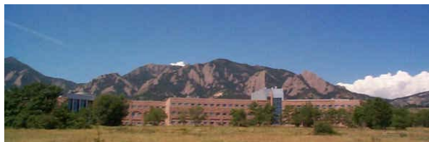
David Skaggs Research Center, Boulder, Colorado, USA

US Department of Commerce National Oceanic & Atmospheric Administration (NOAA) National Environmental Satellite, Data & Information Service National Geophysical Data Center