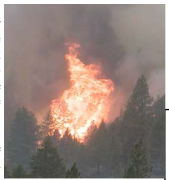
Mill Canyon fire near Coulee Dam on Aug 3

hile the focus for wildfires in the U.S. was along the east slopes of the Washington Cascades late in the summer, it could have been much worse. Overall there were 1432 fires reported in the state of Washington in 2004 that burned 92,021 acres. By comparison the 10 year average is 1371 fires for