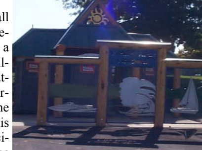
The facility at the 3rd Street boat launch

The collaborating efforts from all three of these organizations resulted in the installation of a weather radio receiver at the facility, that can be activated by boaters to get current weather information before they depart onto the lake. Over 8000 boaters use this boat launch each year. It is anticipated that the new radio and the information it provides will