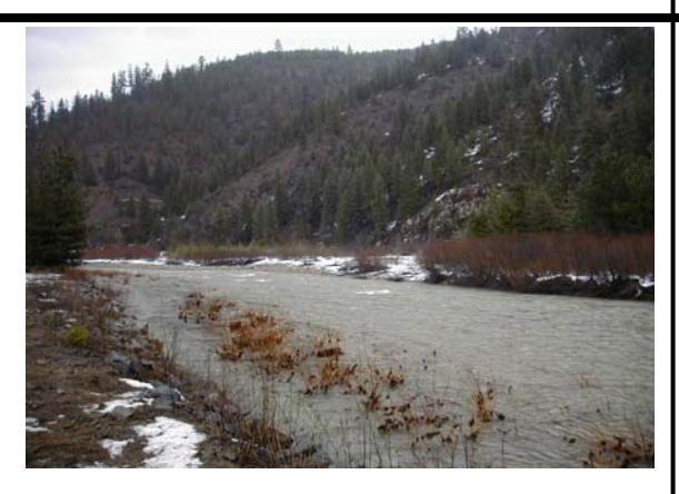
High flow on Pine Creek near Pinehurst, Idaho on February 22nd.

There have been rises on some of the area rivers in the past month. A warm up with rain, winds and high snow levels over the weekend of February 23-24th led to a good deal of snow melt and caused an increased flow on the North Fork of the Palouse River near Potlatch. Other smaller