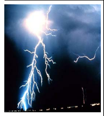
Multiple cloud-to-ground and cloud-to-cloud lightning strokes during night-time. Observed during a night-time thunder-storm