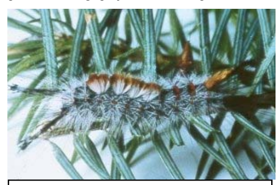
Douglas Fir Tussock Moth in caterpillar stage

Beginning, June 17th, the NWS Spokane will provide onsite weather support to the Forest Service DFTM spray project in the Okanogan Forest. Support for the large project could last up to a month.