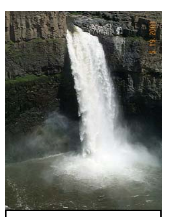
Palouse Falls during peak flow this spring. It is located on the Whitman and Franklin county border in eastern Washington.