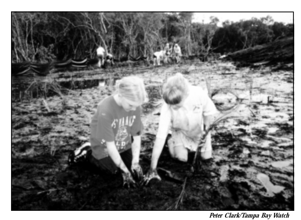
Volunteers plant grasses to help restore a wetland in Tampa Bay.