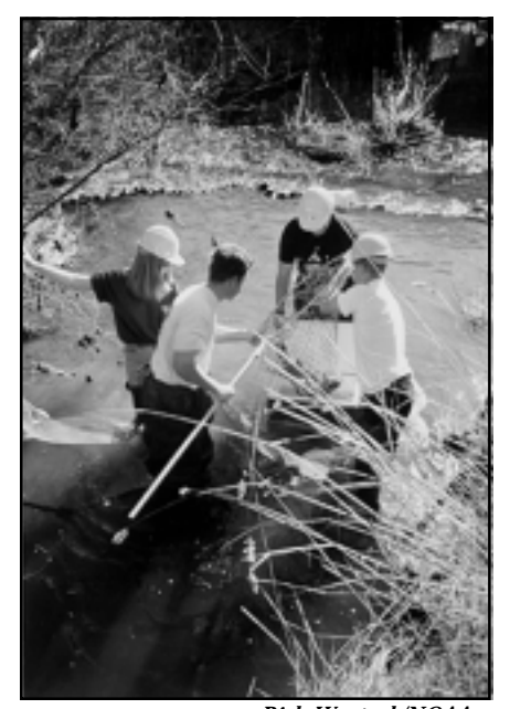
Student volunteers from Petaluma, Calif., restored Adobe Creek with NOAA assistance.

Created in 1996, the program has operated on a shoe-string budget of between $250,000 and