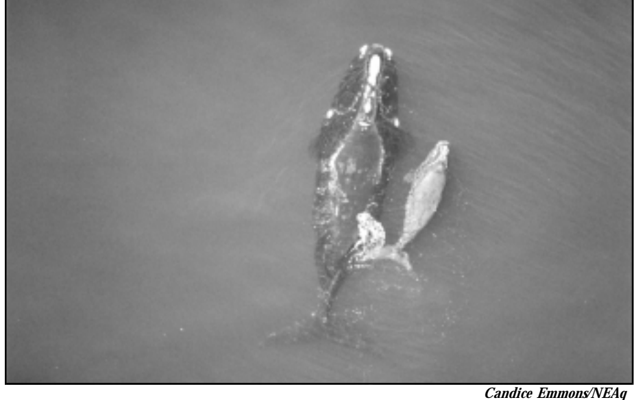
Mother and calf right whales return to NOAA's Gray's Reef National Marine Sanctuary.