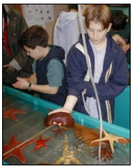
A student examines a young red king crab

in the Auke Bay Laboratory's touch tank.