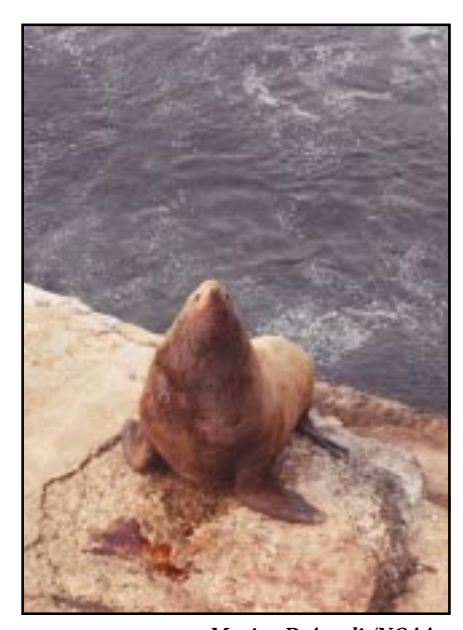
A male Steller sea lion checks out the humans who have come to his rock.