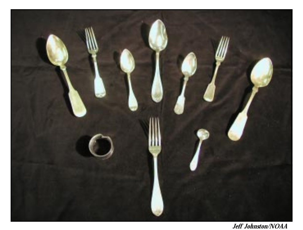
Marine archaeologists recovered several pieces of silver flatware from Monitor's turret, some ingraved with the names and initials of Monitor sailors.