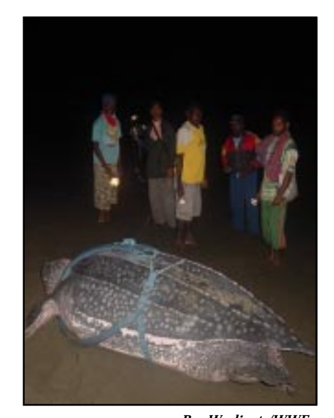
With a satellite transmitter attached to its

back to track its movements, a leatherback turtle returns to the sea.