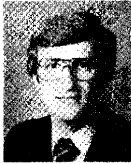
Kent Conrad Vice Chairman