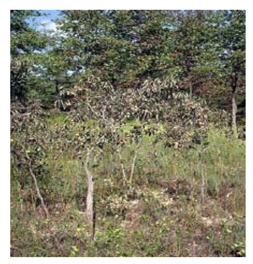
Persimmon (Diospyros viginiana)