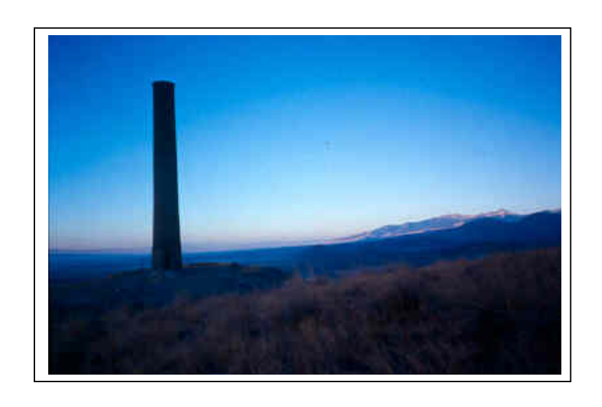
A Report to Montana Natural Resource Damages Program

By Deer Lodge Valley Conservation District in cooperation with the USDA-NRCS Bridger Plant Materials Center