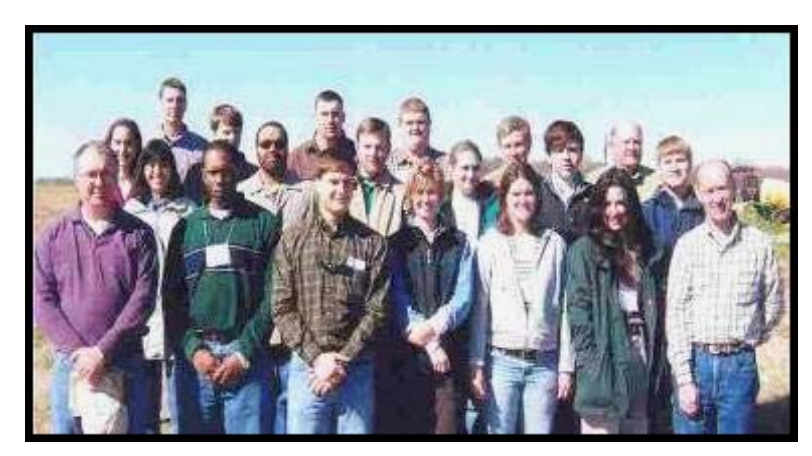
ONE course attendees taken 03/14/06

The MSPMC looks forward to other opportunities to make presentations on the PM Program to the ONE courses, as well as other trainings held at the DCDC and other locations within the service area .