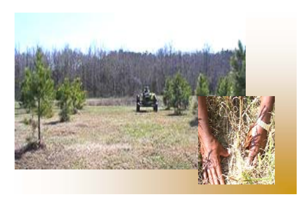
Burndown before grass planting

Beginning this year, harvests will be timed to optimize yield and quality. For switchgrass use 50-60 days; eastern gamagrass-45 days; bermudagrass 35 days. The number of cuttings will be effected by rainfall conditions. Dry matter yield will be determined by cutting a swath from the center of each plot. Sub samples collected for dry matter production will be used for tissue analysis for forage quality.