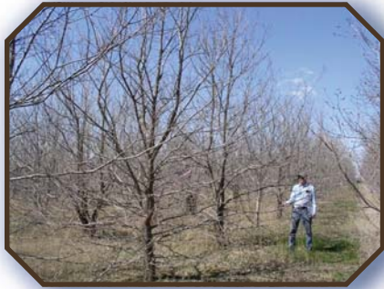
Polk County accession in Mandan evaluation

The Bismarck PMC, in the mid-1980s, released the cultivar 'Oahe' hackberry. The origin of this seed source was a shelterbelt near Gettysburg, South Dakota. About that same time, the Field Offices throughout the Great Plains began collecting seed from local seed sources of hackberry. Hackberry had been identified as an excellent substitute for American elm, which was declining due to Dutch elm disease. The ARS Northern Great Plains Research Laboratory planted seedlings from these seed sources near Mandan in 1990. The soil type on the site is predominantly a Temvik-Wilton silt loam. In 2005, a number of seed sources superior to the Oahe hackberry were noticed in the hackberry planting on the Area IV Research Farm. The best single source is from Polk County, Minnesota, northwest of Crookston. It was collected by Jim Ayen on Roger Wagner's land. After the trees were measured in the summer of 2007, this seed source (ND-3878) averaged almost seven feet taller than the Oahe. Several other seed sources from eastern North Dakota looked better than Oahe. Ordean Jacobson, Kevin Kehrwald, Jerry Timm, and Rod O'Clair collected some of these. A faster growing hackberry tree will be above the reach of the deer sooner. These trees have shown excellent growth, despite grazing by the resident deer population. Almost all the trees have multiple stems, because of the deer pressure. In the future, we will need another choice of tall trees to plant in place of green ash.