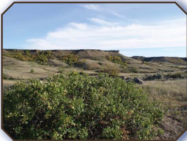
Native skunkbush sumac in the Cave Hills of South Dakota

Skunkbush sumac is a deciduous native shrub that occurs mostly west of the Missouri River. The woody plant grows on dry hillsides, preferring well-drained soils. Sumacs are dioecious, so the fruit is found on the female plants. In the 1950s, a sumac collection was made in central Wyoming. This seed source was released as 'Bighorn' skunkbush sumac. It is not widely used in windbreak plantings in our region. It does have some disease problems when moved to areas of greater precipitation. The Bismarck Plant Materials Center (PMC) and various Field Office personnel have made collections of seed from the central and western Dakotas. Most collections from North Dakota came from Dunn, Oliver, Morton, and Slope Counties. The South Dakota collections are mainly from Corson, Sully, and Lyman Counties. Once the seed is cleaned, it needs to be treated with sulfuric acid before it can be stratified to get it to germinate. The PMC will begin growing seedlings from these sources in the spring of 2008.