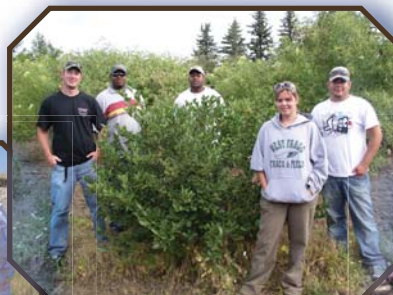
Left: STEP employees touring PMC plots. Featured plant is 'McKenzie' black chokeberry to be released in 2008