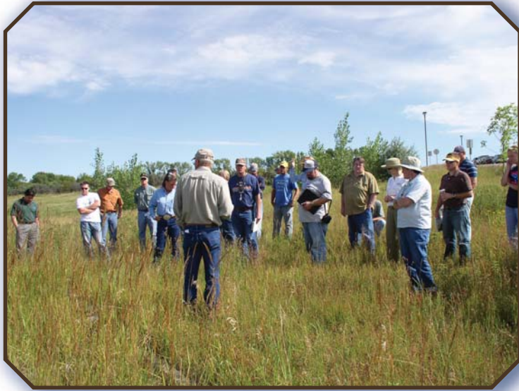
The group discusses native plants at Horizon Middle School