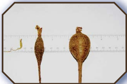
Tuber size after 1, 2, 3 years

Potatoes are not the only tubers growing in the Northern Great Plains. Indian breadroot, a native legume with a tuberous thickened taproot, can be found growing on dry prairies, bluffs, valleys, and open woodlands. Indian breadroot, also known as prairie turnip, was an important food source for the Great Plains Indians. They pulverized the root into flour or ate it raw or cooked. The PMC planted a small plot in October of 2004 to study the growth of prairie turnip. Seed was planted with a mix of grass to closely mimic the prairie. Plants were very slow to grow the first year. The second year (2006) plants flowered and root growth increased. In 2007, numerous plants set seed and root growth was excellent. A study to evaluate planting dates began in November of 2007 with prairie turnip seed planted alone as a dormant seeding. Additional plots will be planted in the spring and summer of 2008 for the planting date study. A goal of the study is to develop seeding recommendations. Future plans include evaluation of seeding rates to meet this goal.