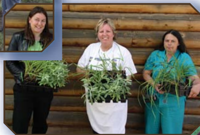
sage for community propagation beds at White Earth Reservation

630 SWEETGRASS PLANTS FOR 25 PLANTINGS 180 WHITE SAGE PLANTS FOR 15 PLANTINGS 369 VARIOUS OTHER PLANTS FOR 12 PLANTINGS