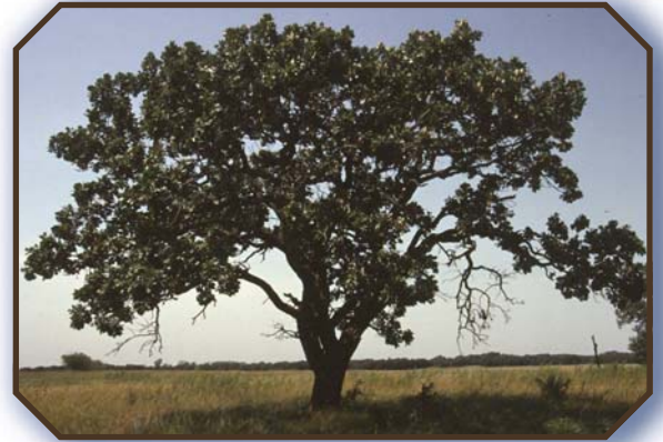
Bur oak in Minnesota

With the threat of new insect pests on the horizon, it is important to develop some additional selections of tall trees for the Northern Plains. One of the more widespread tall trees native to our region is the bur oak. Bur oak is a drought-resistant, long-lived tree. It has a moderate growth rate. In the early 1990s, the SCS field office personnel of the Great Plains made collections of bur oak seed. In 1993, selected seedlings from 90 seed sources were planted in eight blocks, in a nursery at the ARS Research Lab at Mandan, North Dakota. The soils on this site are a Parshall fine sandy loam. The area was fenced to keep out the deer. After 15 growing seasons, the trees were measured in 2007. The seed source with the tallest trees was from Cass County, North Dakota. The trees measured almost 20 feet tall.