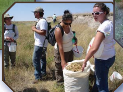
Right: Workshop and seed collection at Badlands National Park