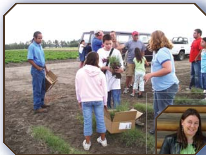
Above: Children from “Horses on the Prairie”, a UTTC summer learning program, collecting native plants for demonstration at the college