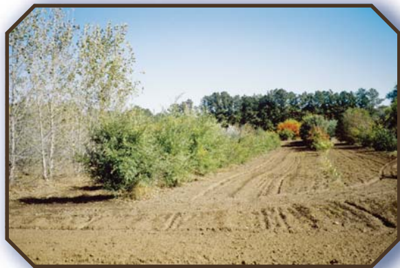
Dickinson, North Dakota Off Center Evaluation Planting (OCEP)

The Bismarck PMC has been planting a wide variety of trees and shrubs in Minnesota, North Dakota, and South Dakota since 1954. The evaluation of new species and seed sources is an ongoing process. Over the years, changing farm programs have had a big effect on the numbers of trees planted. The development of profitable crop residue management systems has resulted in fewer field windbreaks being planted.