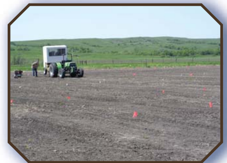
Demonstration planting at Wessington Springs, South Dakota

Grasses that were off to the best start included ‘Mankota’ Russian wildrye, ‘Rodan’ western wheatgrass, ‘Manska’ pubescent wheatgrass, NewHy hybrid wheatgrass, and ‘AC2’ crested wheatgrass. The legumes with the best stand included SDSU yellow-blossom alfalfa, ‘Eski’ sainfoin, and Travois alfalfa. ‘Delar’ small burnet and Dawn birdsfoot trefoil appeared to establish well initially, but the rows were hard to find in the August stand counts.