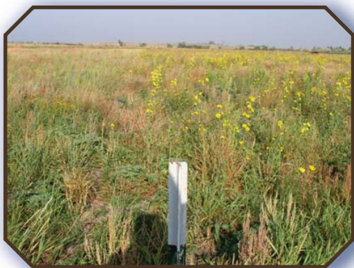
Perennial food plot showing an introduced species planting on the left and a native species on the right