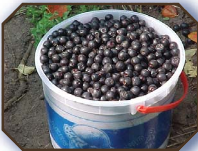
Chokeberry fruit collected at Staples, Minnesota

Black chokeberry is a cold-hardy, deciduous shrub, which is native to Minnesota. This species is sometimes known as Aronia in the nursery trade. The dark-purple fruit can be canned whole, or the juice can be used in jellies and fruit drinks. One of the larger fruit juice producers in the U.S. uses Aronia berries in its blends. Though black chokeberry is native to eastern and central North America, it has been planted extensively in Europe and Asia. In Russia, Denmark and Eastern Europe, the fruit is used for juice and wine production. The Europeans have developed several cultivars, which are now available in the U.S. from commercial nurseries. 'Viking' is a vigorous, productive variety from Scandinavia, which can grow to a height of six feet. 'Nero' is a shorter growing variety, which seems to be less hardy than Viking in North Dakota. The Bismarck PMC received the