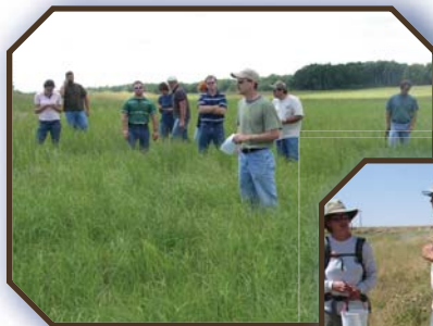
Left: Discussing prairie restoration at the Minnesota Area 1 Plant Materials Tour