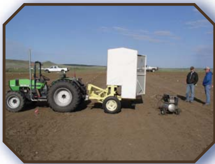
Grass and legume mixture trial near Bison, South Dakota