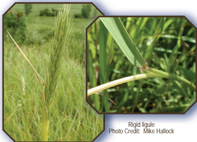
Upright spike seedhead