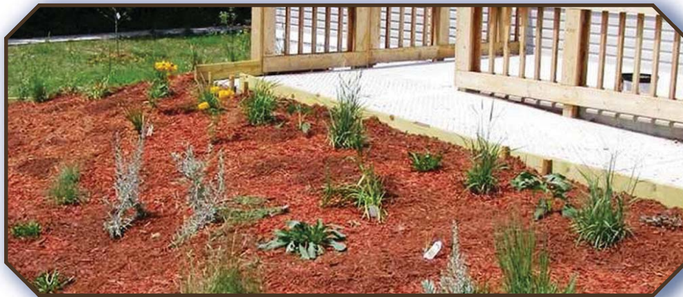
Above: Culturally significant native plants established on the Standing Rock Reservation

The Bismarck Plant Materials Center (PMC) is active in providing seed, plants, and technical information assistance to Tribes and Tribal land users. The majority of plant species provided are culturally significant. The PMC also provides seed and plants of other species for conservation purposes, including lakeshore stabilization, erosion control, and invasive species competition. Plant and seed requests are reviewed and approved by Minnesota, North Dakota, and South Dakota Plant Materials Committees. Most of the special plantings are community projects to demonstrate “how-to” on-site preparation, planting, maintenance, and harvest. Generally, special plantings are limited to 10 plants of each species. Cooperators are encouraged to prepare a clean-tilled, garden-like site, and to water and weed the plantings until they become established. Sweetgrass and white sage are rhizomatous and multiply rapidly on well-maintained sites. Since 2002, approximately 3,300 sweetgrass plants were distributed, primarily to individual Tribal cooperators and communities.