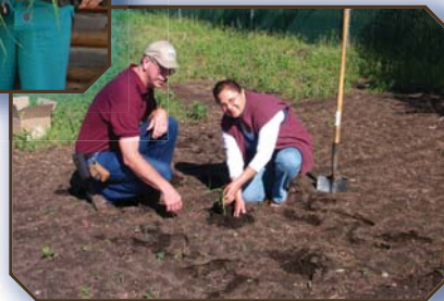
prepared site at Prairie Island Reservation

Technical assistance, plant materials distribution, and evaluations are ongoing with Tribal partners. Activities in recent years include: