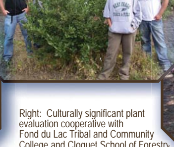
Right: Culturally significant plant evaluation cooperative with Fond du Lac Tribal and Community College and Cloquet School of Forestry