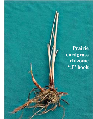
USDA NRCS Plant Materials Center, Bismarck, North Dakota

Streambanks, riparian areas, other erosion control sites: Spacing can vary, depending on slope, stabilization required, mulch, and available plants and resources. Generally, plants are spaced 2 to 10 feet apart and planted in off-set rows. Rhizomes planted along streambanks should be planted several feet beyond the water line. Cordgrass is intolerant of frequent flooding. Ice jams and fluctuating water can wash out plants closer to the water line. Rhizomes planted higher up the slope will readily send shoots down the slope toward the water line.