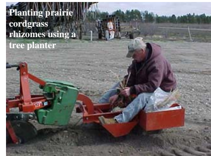
USDA NRCS Plant Materials Center, Bismarck, North Dakota