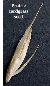
Prairie cordgrass seed USDA NRCS Plant Materials Center, Bismarck, North Dakota

Adapted local ecotype: Seed can be purchased from native plant nurseries and commercial seed growers or can be harvested from local populations. Seed can be hand stripped or combined in late fall. Seed fill is often poor in native harvests. Filled seeds have a kernel or embryo. Cut seeds crosswise to determine fill.