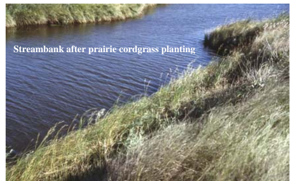
Streambank after prairie cordgrass planting USDA-NRCS Plant Materials Center, Bismarck, North Dakota