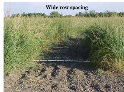
USDA NRCS Plant Materials Center, Bismarck, North Dakota