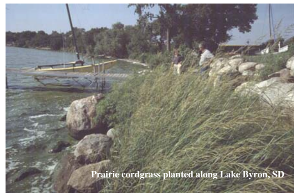
Prairie cordgrass planted along Lake Byron, SD

Prairie cordgrass has a broad climatic adaptation. It will grow on seasonally dry sites, tolerates alkaline condition and high water tables but is intolerant of prolonged flooding. It will grow on a wide array of soil types, but prefers a soil other than sand.