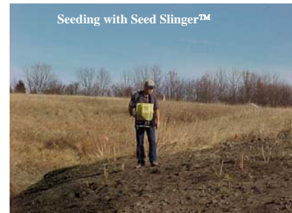
Seeding with Seed Slinger™ USDA-NRCS Plant Materials Center, Bismarck, North Dakota