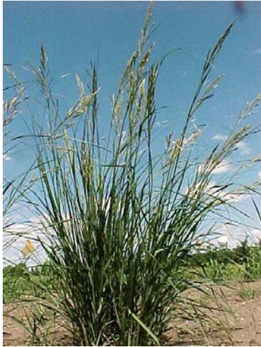
USDA NRCS Plant Materials Center, Bismarck, North Dakota