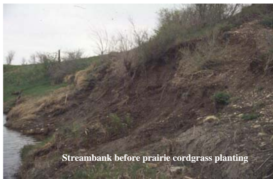
Streambank before prairie cordgrass planting USDA-NRCS Plant Materials Center, Bismarck, North Dakota