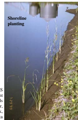
USDA NRCS Plant Materials Center, Bismarck, North Dakota