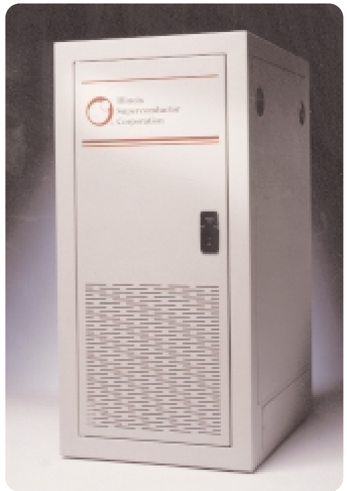
A compact one-box enclosure for RangeMaster® and SpectrumMaster®

This ATP project with Illinois Superconductor Corporation (ISC), a small company founded in 1990, developed technology based on high-temperature super-