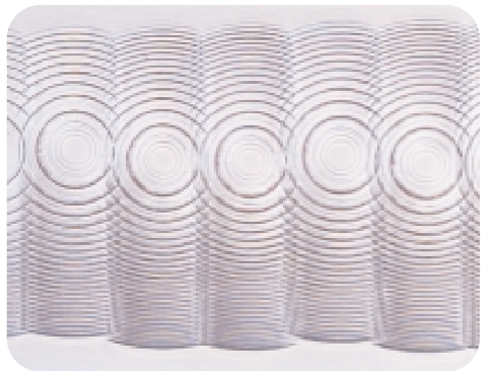
Photomicrograph of an array of multilevel diffractive lenses, fabricated with a 193 nanometer excimer laser.

Cynosure successfully designed and built a customized lenslet array to correct the beams from an array of 200 diode lasers. The researchers, however, failed to build a system that could generate the target power level — 20 watts of laser light from a medical optical fiber — because the company was unable to secure an adequate, low-cost supply of