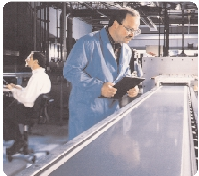
A large area solar grade silicon sheet emerging from a silicon growth reactor which incorporates new ATP-funded technology.

that promotes the growth of the epitaxial layer laterally much faster than vertically from the substrate. Company researchers made significant advances in understanding growth processes for compound semiconductor materials