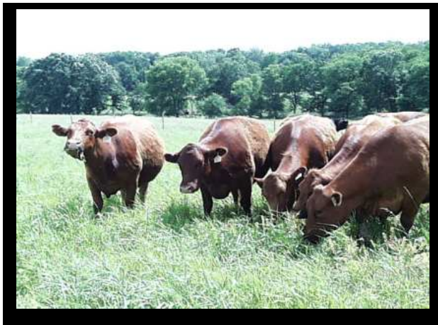
Cattle Grazing Cuivre River Virginia Wildrye in June, Lincoln County Missouri