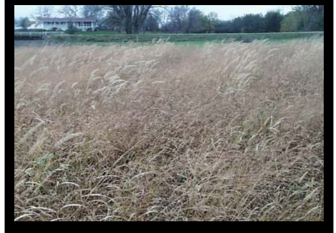
Iowa Ecotype Switchgrass Central Zone, Webster County