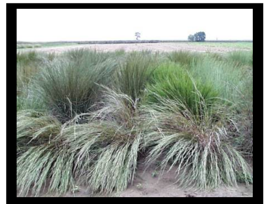
Southern Selection Little Bluestem

The Southern selection is available for field testing purposes. It will be compared with a release cultivar in a single species evaluation for grazing and wildlife field buffers.