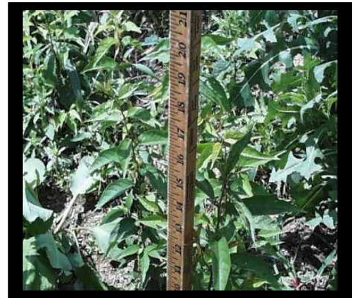
20" American Plum Seedling by Middle of Summer.

Average heights 15 inches; tallest, 40 inches