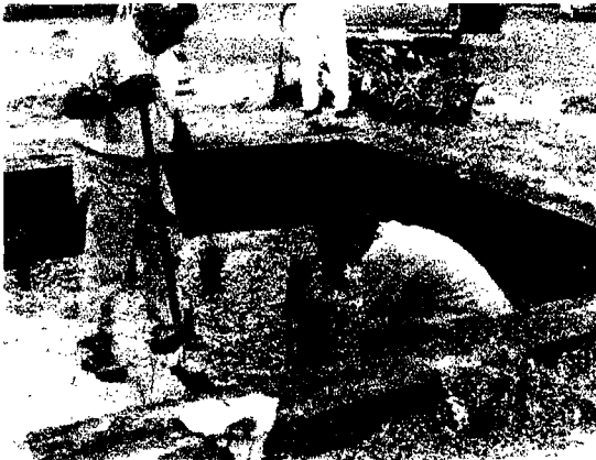
September 1999 – Dan Schullenburg (left) and Melvin Adams, PMC Manager, plant a constructed wetland system near Converse, Louisiana.

Conclusion: The best germination of Giant Blue Iris seed occurs with the corky coating left intact. It is suggested that the seed be planted in germination trays soon after harvesting. Keep the potting medium moist. Plants approximately six to eight inches tall should be removed from germination trays to small pots for further growth and root development. Plants more than ten inches tall are adequate for outside transplanting in early spring.