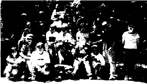
October 1999 - Evenstart elementary students from Diboll, Texas.

During 1999, 1400 people toured or utilized PMC facilities for educational contests or training. The PMC staff gave educational tours to school groups from around the area.