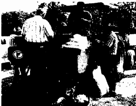
Liberty County, Texas

Several demonstration plantings were established this year.