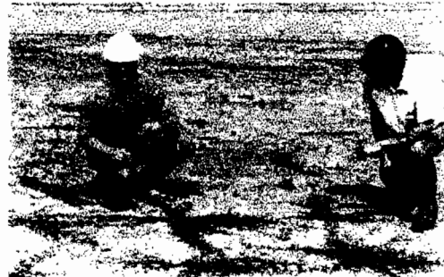
Glenn Stewart and Melvin Adams evaluate a planting of Herbaceous mimosa at Sabine Mine.

At planting time, the soil moisture was fair. Six week old herbaceous mimosa plants were installed on April 21, 1999 in 15 x 20 ft. replicated plots on 3 x 3 ft. and 2 x 2 ft. spacings.