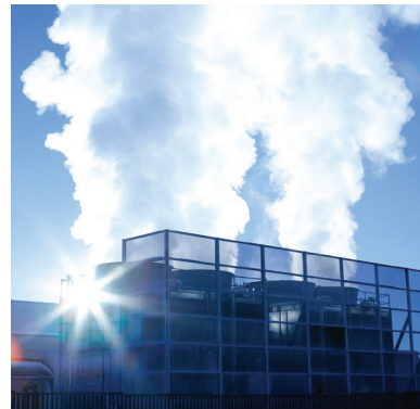
Cooling towers at the Los Alamos Metropolis Center for Modeling and Simulation dissipate the heat generated by the Laboratory's supercomputers.

The cost of all phases of the Roadrunner project is approximately $120 million. More than 200 Laboratory employees have been involved in this effort.