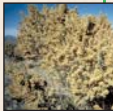
Fourwing saltbush mature seed.