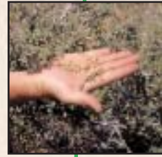
Seeds of antelope bitterbrush.

AOSCA has implemented certification requirements and standards that accommodate plant germplasm (whether newly acquired accessions or named varieties) of native grasses, forbs, and woody plants. These certification procedures provide third-party verification of source, genetic identity, and genetic purity of wildland collected or field or nursery grown plant germplasm materials. This bulletin defines AOSCA plant germplasm types, describes certification procedures and labeling, and summarizes supporting guidelines, tables, and flow charts.