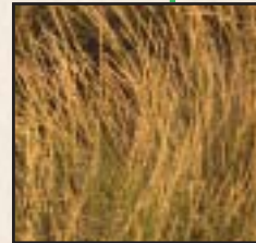
Bluebunch Wheatgrass seed heads.

As an alternative to formal variety release, AOSCA Pre-Variety Germplasm (PVG) categories facilitate orderly procurement, production, and distribution of plant germplasm materials. The PVG categories offer a parallel progression with the first three above numbered stages for variety development. They are respectively designated as (1) Source Identified Class (unevaluated germplasm identified only as to species and location of the wild growing parents), (2) Selected Class (germplasm showing promise of desirable traits,