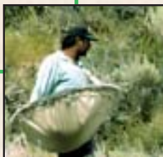
Collecting antelope bitterbrush with seed hopper.

For some broadly adapted species characterized by copious seed production, wildland collection can supply a significant seed volume for direct plantings. For most species, however, accessions consisting of limited quantities of seed obtained from defined wildland stands must be increased in fields or nurseries. Unfortunately, accurate documentation of collection site and/or cultivated production has often been unavailable to those seeking site-appropriate native plant materials. This situation led to the expansion of AOSCA third-party inspection and labeling programs to specifically address the needs of the native seed and plant industry.