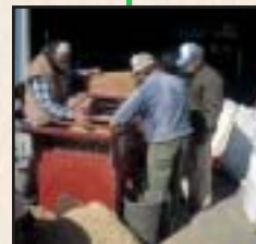
Conditioning wildland shrub seed.

Formal variety release is applicable when geographic adaptability and market potential are well defined, and is necessary when seeking protection under the Plant Variety Protection Act. Utilization of PVG categories is applicable when a) identification and propagation of species and/or ecotypes at various stages of evaluation are needed for timely (often immediate) restoration of specific geographic areas, b) market potential is limited beyond specific geographic areas, and/or c) accommodating consumer special plant material demands (refer to both sidebars in Fig. 1).