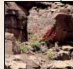
Firecracker penstemon, wildland site.

As an alternative to formal variety release, AOSCA Pre-Variety Germplasm (PVG) categories facilitate orderly procurement, production, and distribution of plant germplasm materials. The PVG categories offer a parallel progression with the first three above numbered stages for variety development. They are respectively designated as (1) Source Identified Class (unevaluated germplasm identified only as to species and location of the wild growing parents), (2) Selected Class (germplasm showing promise of desirable traits,