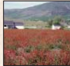
Firecracker penstemon, seed field production.

Germplasm assigned to either track follows a similar progression relative to AOSCA germplasm types, and is appropriate for end use depending on the objectives for the planting site. To facilitate this germplasm status distinction, “natural-track” recognition as applicable to a specific germplasm should be so noted on certification tags (see Additional Label Information section).