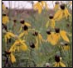
Grayhead prairie coneflower.

The number of field or nursery increase generations allowed (as well as length of stand, isolation distances required, and seed purity and viability standards) for all germplasm types may be specified by AOSCA. Factors considered are the mode of reproduction, genetic stability, plant longevity, and seed characteristics of individual species. The AOSCA generation limit for sexually reproduced or apomictic Pre-Variety Germplasm is five (unless otherwise specified), while vegetative generations may be unlimited.