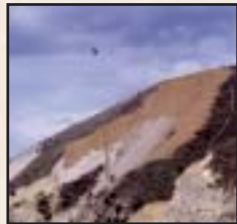
Road cut stabilization and restoration.

Large-scale natural and human-caused ecosystem disturbances generate a voluminous demand for native plant reproductive materials (most commonly seed) intended for restoration, revegetation, and stabilization of natural communities. This demand is enhanced by an increasing interest in establishing populations of native wildflowers, grasses, trees, and shrubs in parks, wildlife refuges, roadsides, tree farms and orchards, and residential landscapes.