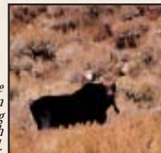
Native collector in mountain big sagebrush stand.