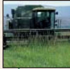
Harvesting basin wildrye.