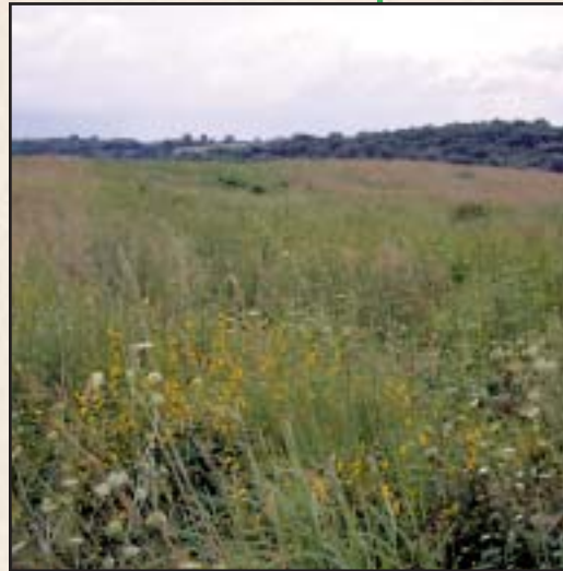
Prairie restoration project.