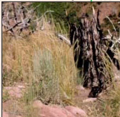
Fire rehabilitation seeding success.