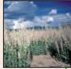
Palmer penstemon, seed field production.

Variety/cultivar tags (Breeder, Foundation, and Registered are similar in format to the Certified example shown in Fig. 2) provide little information beyond kind (species), variety name, and certification/lot number, since the formal release notice would supply pertinent variety source and development information. It is recommended, however, that “natural-track” status (if applicable) and known regions or zones of adaptation be listed on the tag for native plant varieties/cultivars.