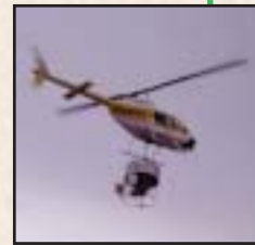
Aerial fire rehabilitation seeding.