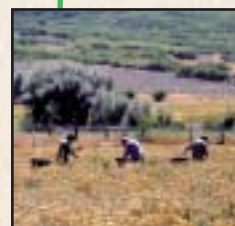
Western yarrow, seed field production.

A germplasm accession may potentially be shepherded through PVG categories on either genetic track to achieve formal release. For most native plant accessions, however, germplasm evaluation and comparison are designed to facilitate native plant use in localized site revegetation rather than for advancement toward formal release. In this context, a germplasm designation within any PVG category (Source identified, Selected, or Tested) is a legitimate end product. Many public and private agencies follow internally established protocols for germplasm acquisition, study, development, and/or release, though such formality is not a basic requirement in utilizing PVG certification. Germplasm eligibility for a given PVG category must be supported by documentation submitted to and accepted by an AOSCA seed certification agency.