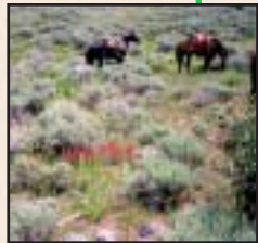
Wasatch Mountain Range wildlands.

The reproductive materials required to satisfy these planting needs have some special constraints. Most plant species consist of more or less continuous genotypic arrays reflecting differential adaptation to variation in soils, climates, and disturbance regimes across a species' range of distribution. Long-term success in restoring a species to a given site is dependent upon obtaining adapted plant materials. Adapted plant materials are most likely to originate from the same site or nearby sites with similar physical and biological environments, unless the species' population is known to be broadly adapted or particular accessions have proven to be widely adapted within the species' range of distribution.