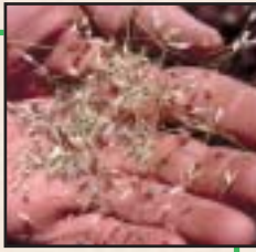
Indian ricegrass seed.