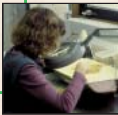
Wildland seed analysis.

Natural-track wildland collected seed is by definition Generation zero (G0) since it is an unrestricted representation of an intact G0 parent population. For a manipulated-track germplasm the G0 parent plants, which by convention for cultivated populations produce G1 seed, must be formally defined by the developer in consultation with an AOSCA agency. As shown in the pre-variety germplasm class boxes in Fig. 1, generations are designated G0, G1, G2, G3, etc., which are analogous to the variety/cultivar generation designations of Breeder, Foundation, Registered and Certified.