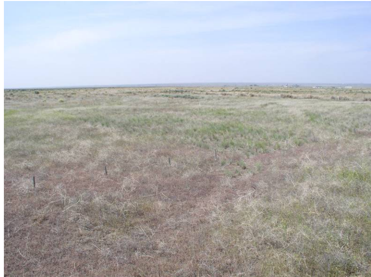
Orchard test site on May 16, 2007.

The Orchard Display Nursery was planted on November 16, 2004 in cooperation with the Great Basin Native Plant Selection and Increase Project. The nursery includes 82 accessions of 27 native and introduced grass, forb and shrub species. Each accession was planted in 7 X 60 foot plots. See Tilley et al (2005) for descriptions of the species and accessions planted. The remaining area was planted to a cover crop mix of 50% Anatone bluebunch wheatgrass, 20% Bannock thickspike wheatgrass, 20% Magnar basin wildrye and 10% Snake River Plains fourwing