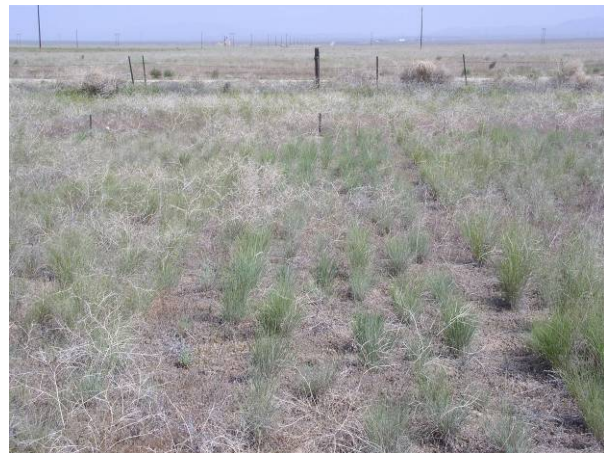
Jim Creek bluebunch wheatgrass, 2007.

The bluebunch wheatgrass accessions had the highest average densities of all the native grasses. All decreased slightly in density from 2005 to 2006, but still maintained good stands. P-12, Wahluke and Jim Creek all had densities over 1.00 plants/ft 2 . Columbia, Anatone, P-7 and P-15 had densities between 0.50 and 1.00 plants/ft 2 while P-5 and Goldar both shared low densities. In 2007 densities were generally slightly lower, but still higher than all other species as a whole. The highest density recorded in 2007 was Jim Creek at 1.07 plants/ft 2 .