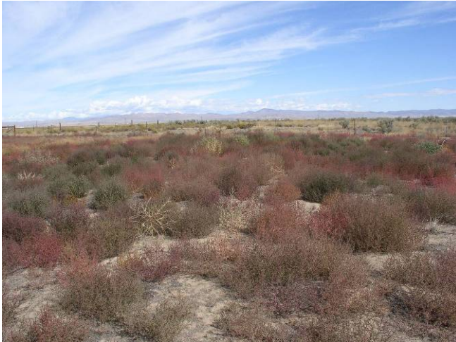
Orchard display site in September 2004 prior to final mechanical seedbed preparation

The Bureau of Land Management (BLM) burned the site in the fall of 2002. The site was later sprayed by PMC staff in May 2003 and May 2004 with a Roundup/2, 4-D herbicide mix to create a weed free seedbed. Due to limited breakdown of dead grass clumps that would inhibit proper seed placement with a drill and to ensure a clean seedbed, the decision was made to cultivate the site with a culti-packer just prior to seeding. During the first evaluation most plots contained high numbers of Russian thistle ( Salsola sp.) and moderate amounts of bur buttercup ( Ranunculus testiculatus Crantz) plants. Russian thistle plants were approximately