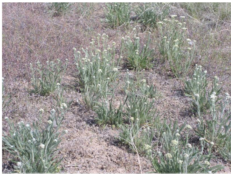
Stand of Eagle yarrow, May 2007.

Despite some good stands in 2005, all of the forb and shrub accessions except for Eagle yarrow had zero plants during the 2006 evaluation. Eagle had 0.07 plants/ft 2 in the frequency grids along with a small stand of plants at one end of the seeded plot. In 2007 more plants of Eagle had either germinated from the original seeding, or seed had spread from established plants. Plant density for Eagle in 2007 equaled 0.24 plants/ft 2 . Snake River Plains fourwing saltbush also had a single plant found in the plots, increasing its density from 0.00 to 0.02 plants/ft 2 .