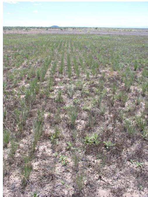
Columbia bluebunch wheatgrass, May 2006

There were forty-seven accessions of native grasses planted. Overall the native grasses established well considering the limited amount of precipitation received over the winter and early spring of 2005. Especially good stands were seen in the bluebunch wheatgrass and Snake River wheatgrass plots during 2005. There was a marked decrease in plant density between the first and second evaluations with some notable exceptions. Seven of nine bluebunch wheatgrass accessions and three of four Snake River wheatgrass accessions increased in density from the first evaluation to the second. This is possibly due to receiving 2.5 inches of precipitation during that period and/or from a lack of pressure by black grass bugs ( Labops sp.). Most of the native grasses decreased in density from 2005 to 2006 with the exception of Covar sheep fescue and all of the Sandberg bluegrass accessions. These may have been plants that germinated late in the first growing season or, more likely, were too small to notice under the heavy growth of mustards and were more