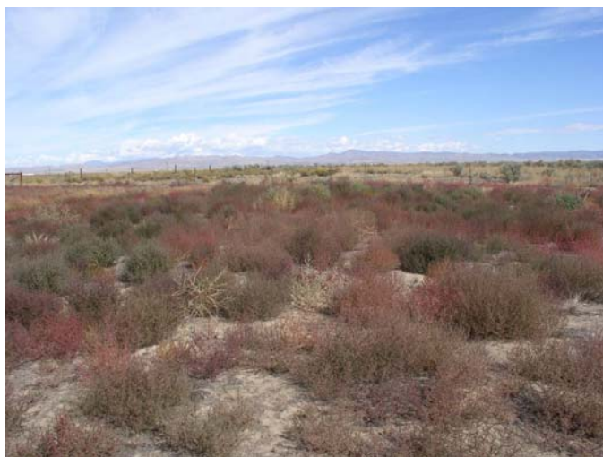
Orchard display site in September 2004 prior to final mechanical seedbed preparation

The Bureau of Land Management (BLM) burned the site in the fall of 2002. The site was later sprayed by PMC staff in May 2003 and May 2004 with a Roundup/2, 4-D herbicide mix to create a weed free seedbed. Due to limited breakdown of dead grass clumps that would inhibit proper seed placement with a drill and to ensure a clean seedbed, the decision was made to cultivate the site with a culti-packer just prior to seeding. Plots were evaluated for initial establishment on April 27 and May 5, 2005. During the first evaluation most plots contained high numbers of Russian thistle ( Salsola sp.) and moderate amounts of bur buttercup