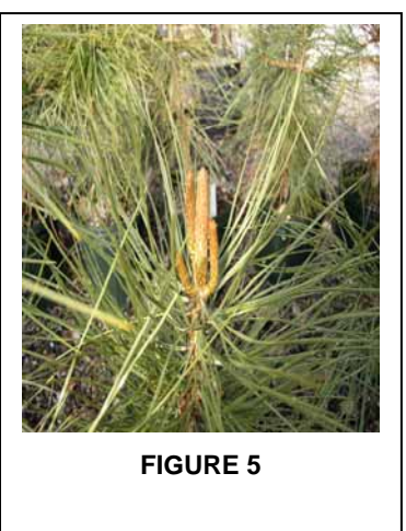
EXAMPLES OF DECIDUOUS AND CONIFEROUS SPECIES IN EARLY STAGES OF ACTIVE GROWTH