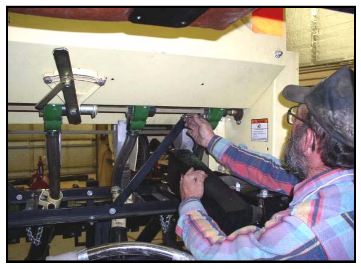
Figure 5. Using a millimeter ruler to adjust openers during drill calibration.