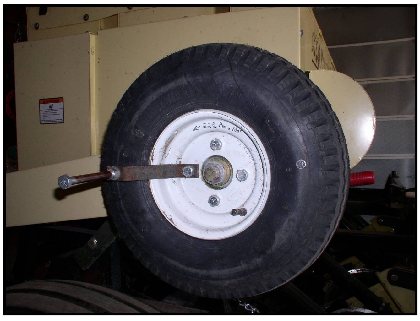
Figure 4. Floating drive wheel with drive handle for calibration, and number of and direction of rotation for drill calibration.