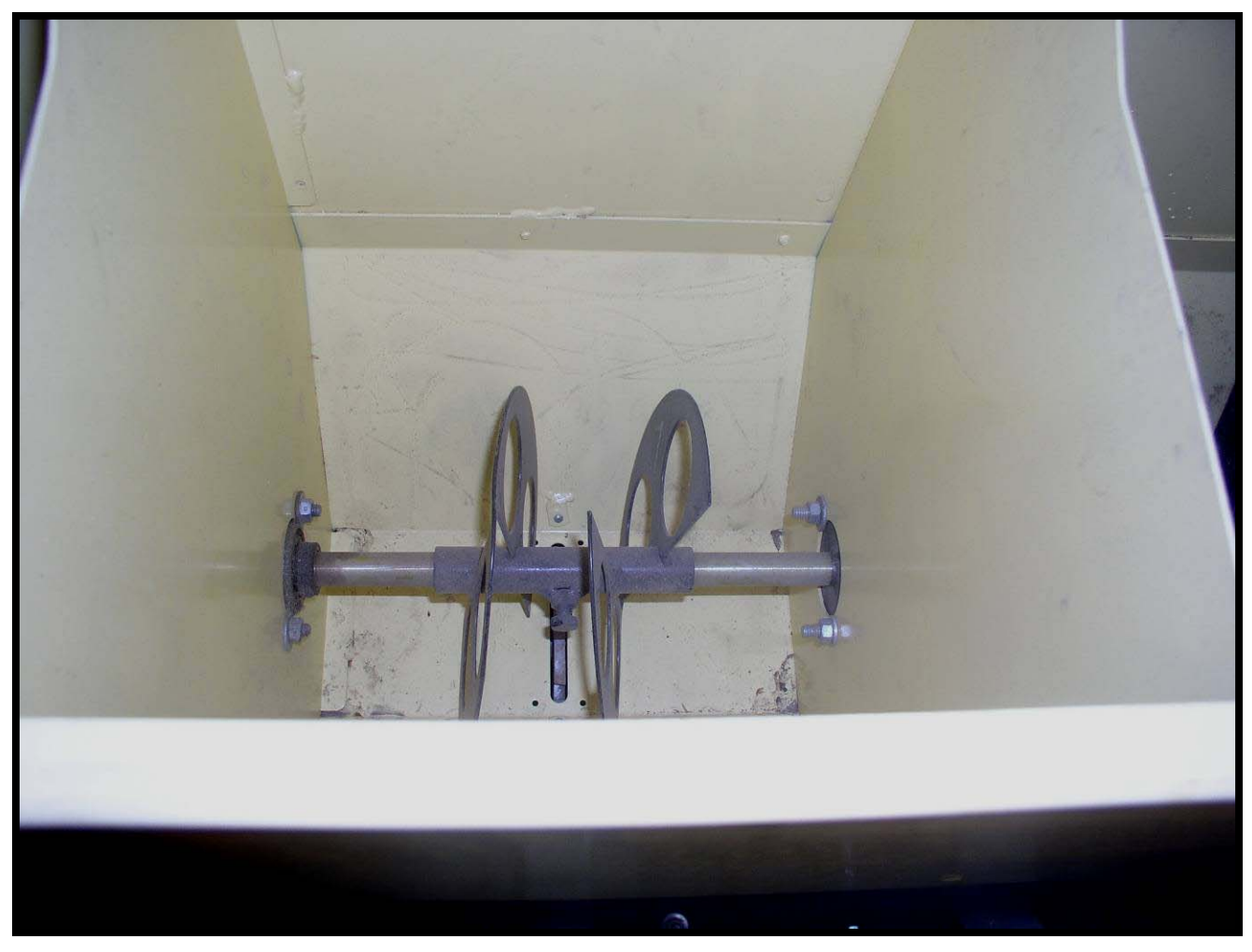
Figure 6. View of inside of fluffy box showing agitator and picker wheel.