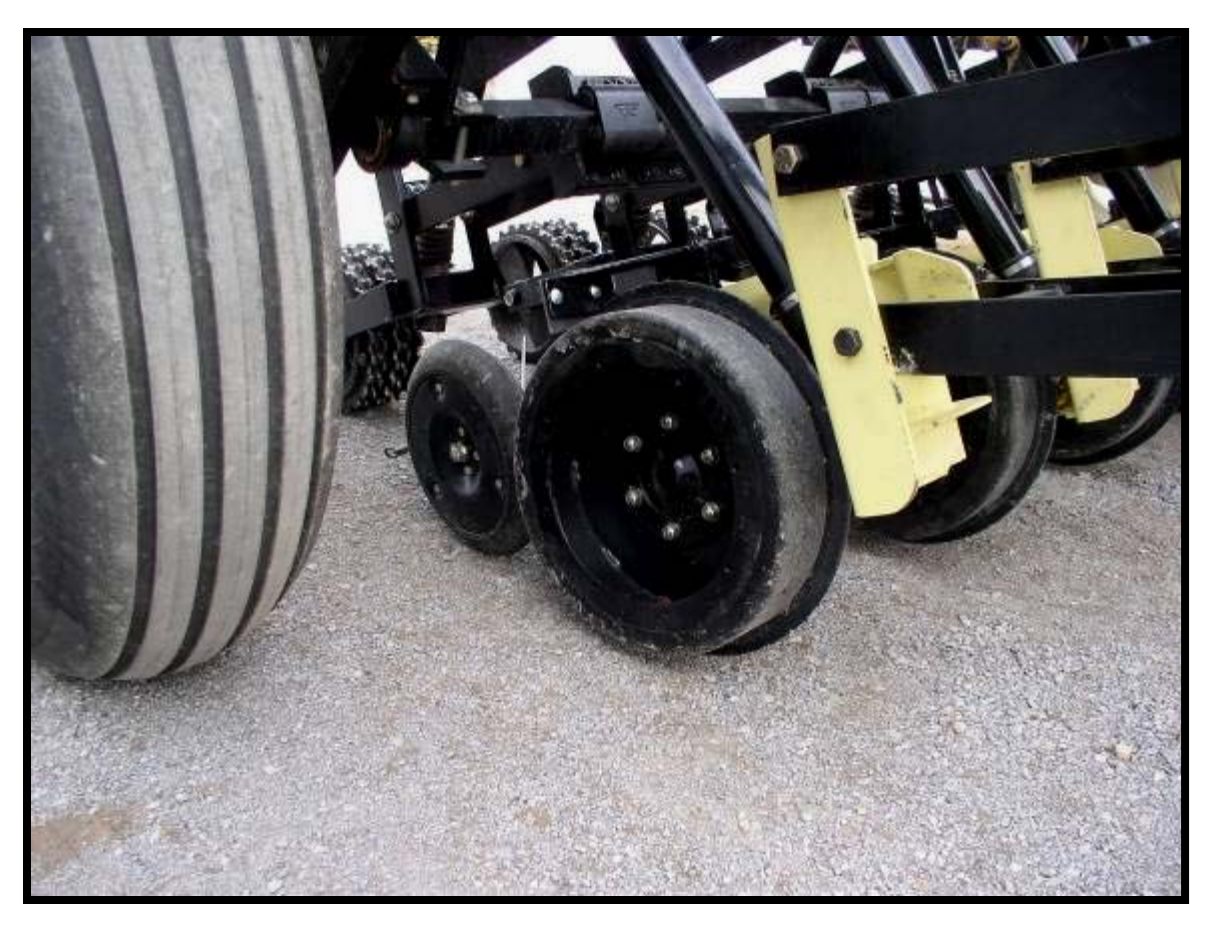
Figure 1. Close-up view of drill seeding unit.