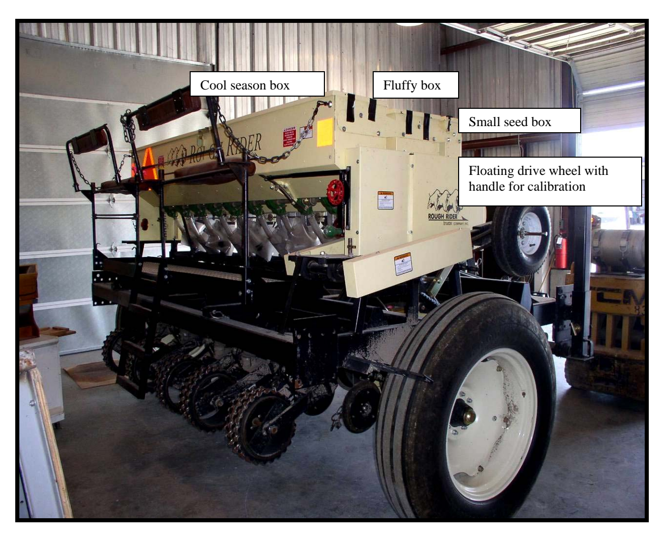
Figure 2. Truax Roughrider seed drill showing location of seed boxes and floating drive wheel with handle for calibration,