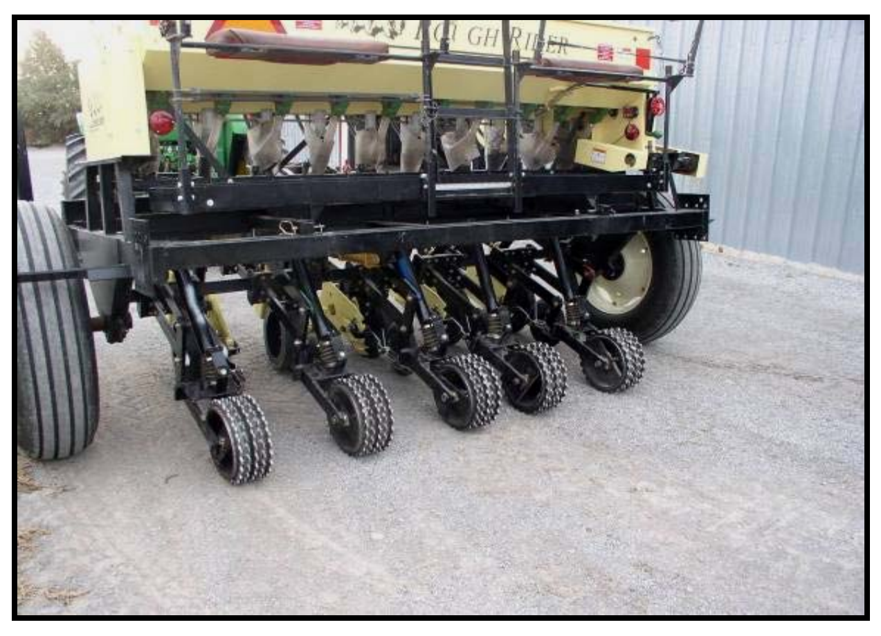
Figure 3. Drill with broadcast planter attachments on alternating rows with drill units.