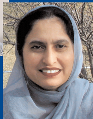
d. Woman with chunni