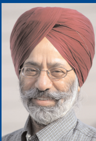
a. Man with pagri