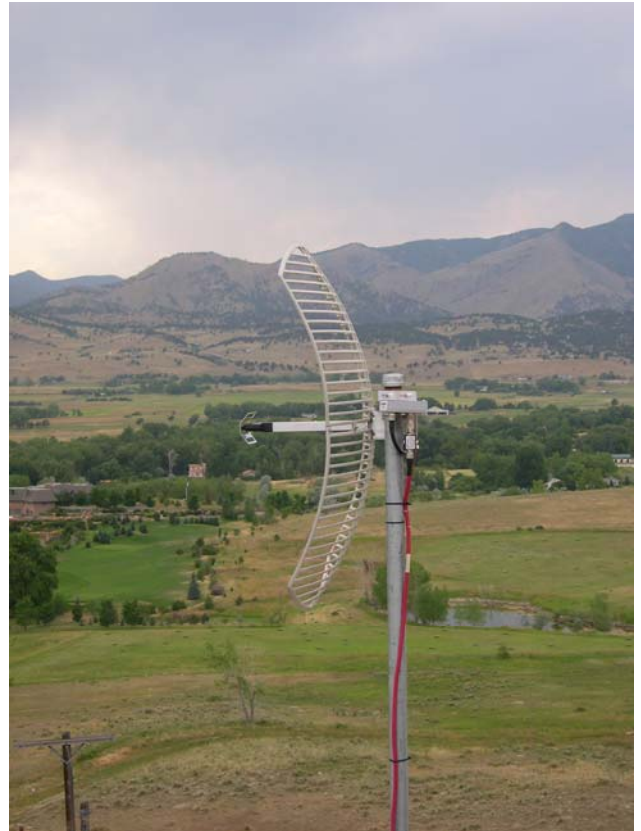
Figure 3. High-gain directional antenna employed at one outdoor link at the Table Mountain field site (photograph by C. Redding).

Contact: Christopher Redding 303-497-3104 credding@its.bldrdoc.gov