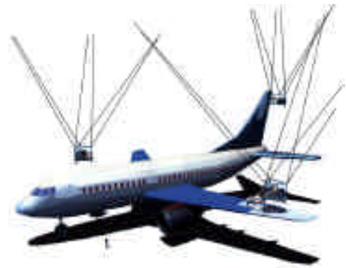
Figure 1. Cable robots capable of six-degree-of-freedom motion, in an aircraft maintenance application. Winches on the moving platforms lengthen or shorten cables in a coordinated way to move the platform in an intuitive coordinate system. Computer control calculates the transformations from user coordinates to cable lengths.

Amplifiers with built-in velocity servos power the winch motors. The amplifiers provide a serial interface over which velocity commands and position feedback are sent. Depending on the configuration, a single serial link may connect to a single amplifier serving a single motor, or several amplifiers each controlling several motors may share a single serial link. This complicates the communication protocol and reduces the available bandwidth for control, and requires the use of RS-485 multidrop serial signaling instead of the usual RS-232 single-drop serial signaling supported for example by a PC’s COM1 port. These signaling types are jumper-selectable on the PC/104 modules.