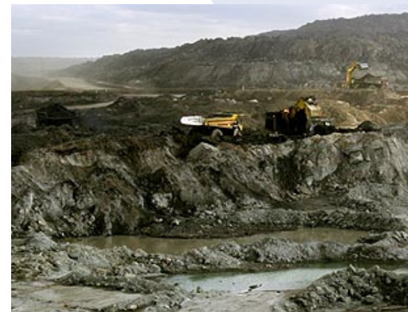
Open-pit mining uses shovels and large trucks to remove oil sand — a thick and sticky form of crude oil — in Fort McMurray, Canada.

In the reactor, hydrogen sulfide gas is first separated from the crude oil stock, using technology already in place. This gas is then bubbled through molten cop-