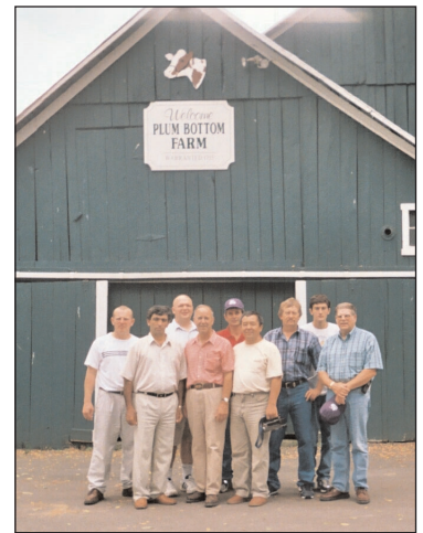
Kazakh interns pose with their U.S. hosts at Plum Bottom Farm in Belleville, PA