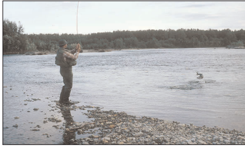
DVS TOUR operates ecological, fly-fishing, trophy hunting, and rafting tours in the Magadan region. Through a SABIT Grant ecotourism and conservation meet in an international effort to protect and value these natural resources.