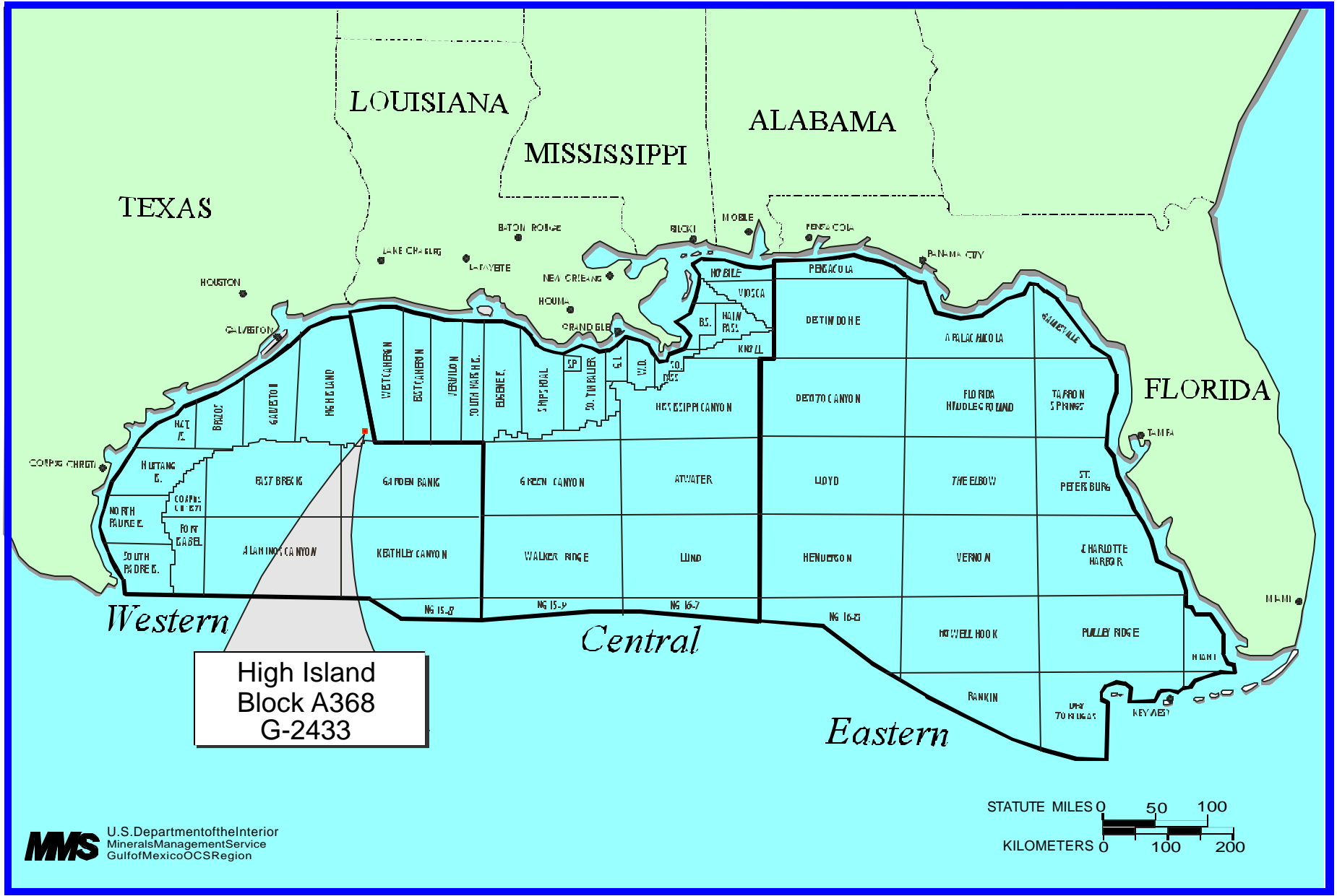
Location of Lease OCS-G2433, High Island Block A368