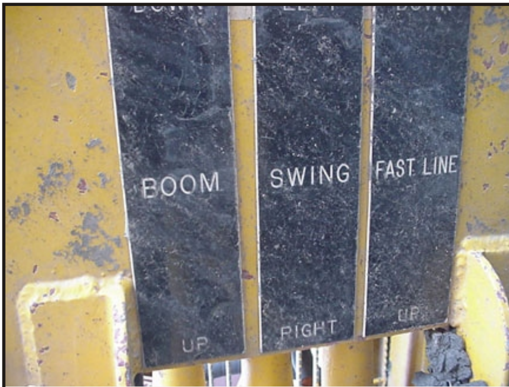
Photographs of Control Handles - ST185 Crane