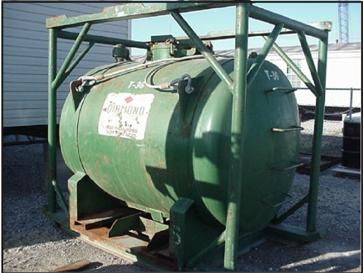
Photograph of Diamond Tank Rental 25-Barrel Tote Tank