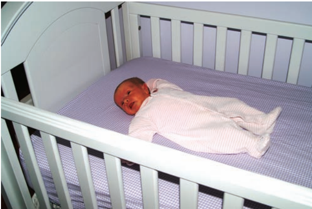
Baby cribs are one of 15,000 consumer products under CPSC's jurisdiction.

The Consumer Product Safety Commission (CPSC) is responsible for protecting families from hazards related to consumer products in its jurisdiction, such as toys, baby cribs, power tools, cigarette lighters, and household chemicals. CPSC monitors injuries and deaths resulting from consumer products and works with industry to develop voluntary standards to make products safer. Where these steps are insufficient to protect Americans from unnecessary risks, CPSC develops mandatory rules and conducts product recalls. CPSC also educates consumers on potentially dangerous products. A list of recalled products can be found at www.recalls.gov . The President's 2007 Budget