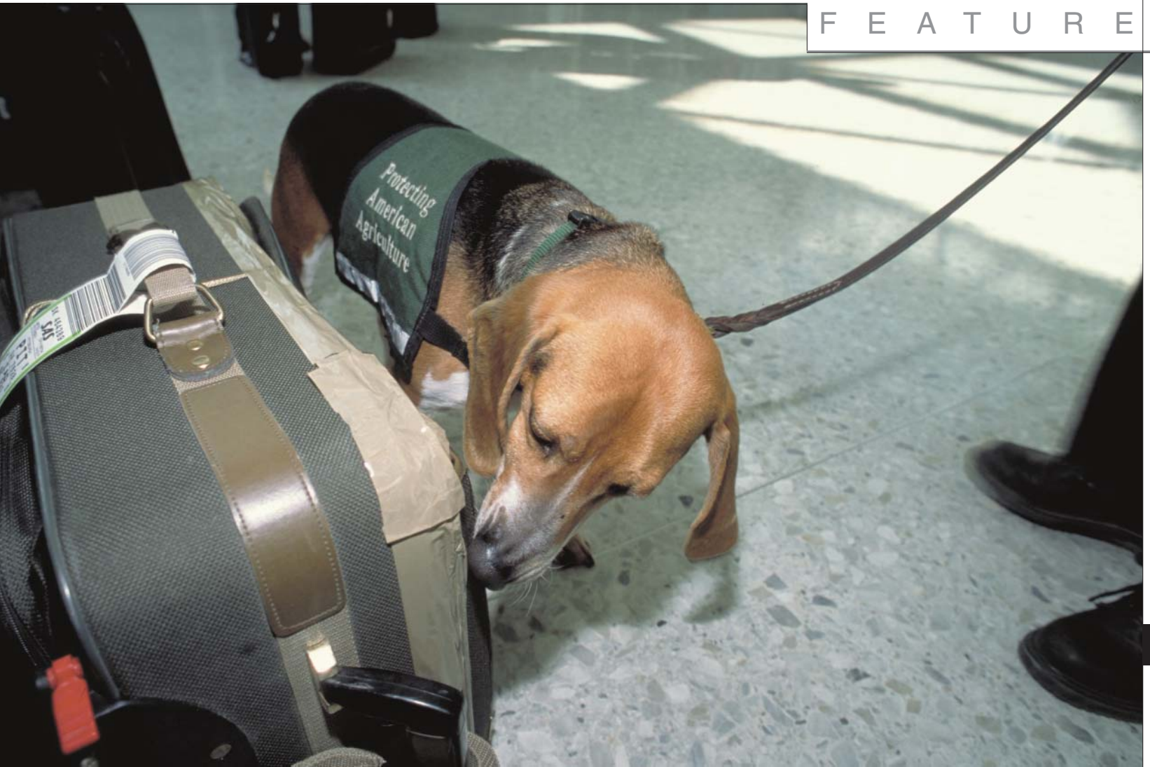
Ken Hammond, USDA

Interceptions of live medfly larvae in separate shipments of clementines from Spain during November and December of 2001 prompted USDA to ban this fruit temporarily and re-examine its cold treatment protocols. After imports were suspended, APHIS launched an investigation to identify the causes of the infestations to determine if there were feasible phytosanitary measures that could be adopted to permit trade to resume. Investigators determined that the infestations were due to a number of factors, including unseasonably warm weather conditions and above-average medfly populations during the 2001-02 growing season, susceptibility of early-season clementine varieties, and problems with the application of cold treatment.