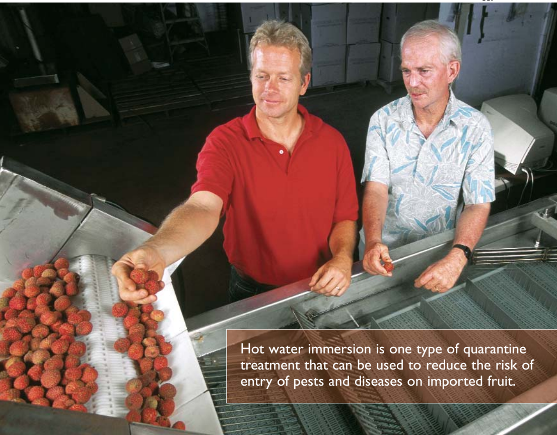
Hot water immersion is one type of quarantine treatment that can be used to reduce the risk of entry of pests and diseases on imported fruit.

that might arise from changing trade flows, cropping patterns, or pest populations. Finally, continuing research can help policymakers capitalize on new scientific discoveries and technological innovations in order to increase welfare-enhancing trade. W