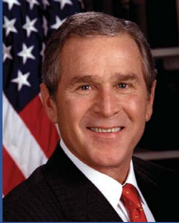
President George W. Bush May 21, 2003

“Today, I would like to announce a new USA Freedom Corps initiative called Volunteers for Prosperity, which will give America’s highly skilled professionals new opportunities to serve abroad. The program will enlist American doctors and nurses and teachers and engineers and economists and computer specialists and others to work on specific development initiatives, including those that I have discussed today. These volunteers will serve in the countries of their choice, for however long their project takes. Like generations before us, this generation of citizens will show the world the energy and idealism of the United States of America.”