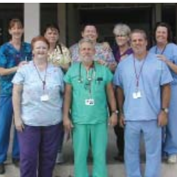
New Frontiers Health Force volunteers in Haiti, 2004.

The following was included in a FY 2004 RFA: “Programs should be reinforced by American volunteerism to the maximum extent practicable. President Bush has made combating global poverty and stimulating prosperity in developing countries a national priority. On May 21, 2003, he expanded his call to volunteer service by issuing a call to Americans trained in professional specialties to serve as volunteers with nonprofit organizations helping to generate prosperity in countries around the world. Applicants are encouraged to read about the Volunteers for Prosperity initiative at www.usafreedomcorps.gov and include in their proposal ways and means to utilize skilled American volunteers strategically in their program.”