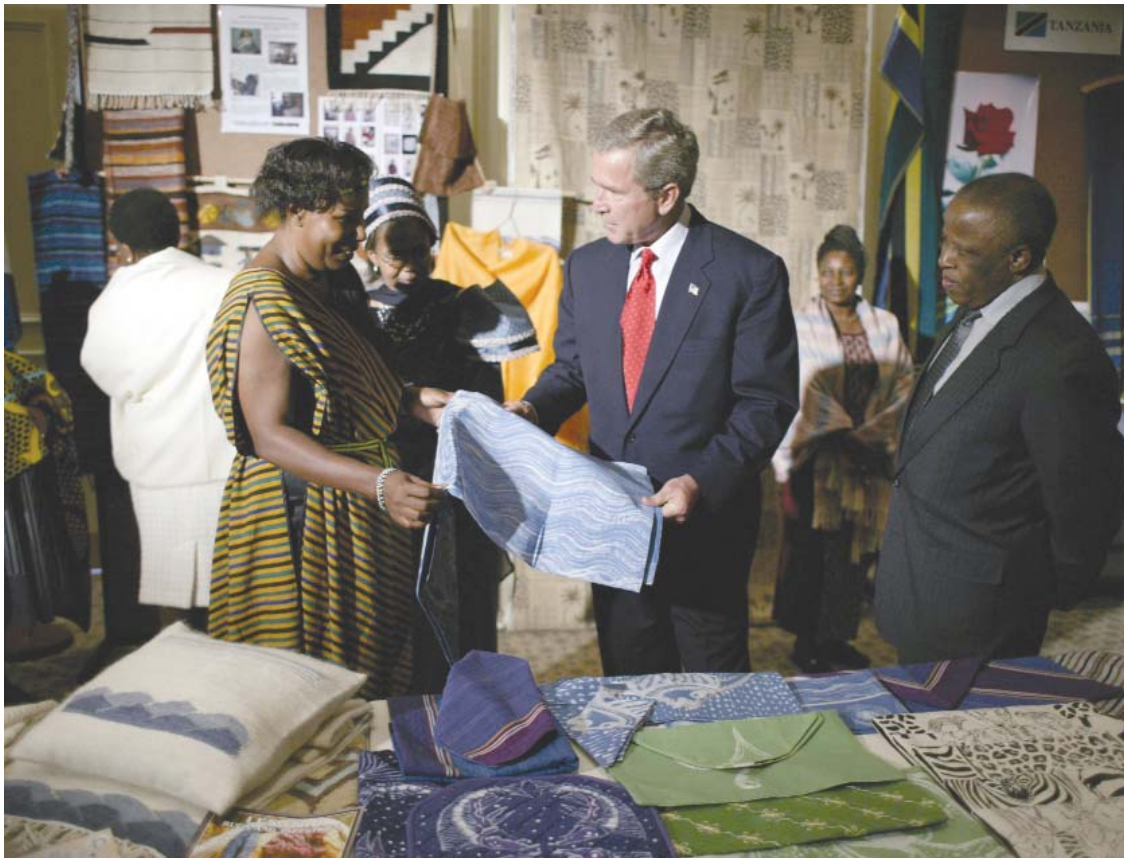
President George W. Bush participates in a tour of the Southern Africa Global Competitiveness Hub with President Festus Gontebanye Mogae of Botswana, July 10, 2003.

MCC , initiated by President Bush and established through legislation signed in 2004, seeks to reduce poverty by significantly increasing economic growth through targeted investments in recipient countries. To be eligible for assistance, countries must demonstrate commitment to three standards: ruling justly, investing in their people, and encouraging economic freedom. MCC received $650 million in FY 2004.