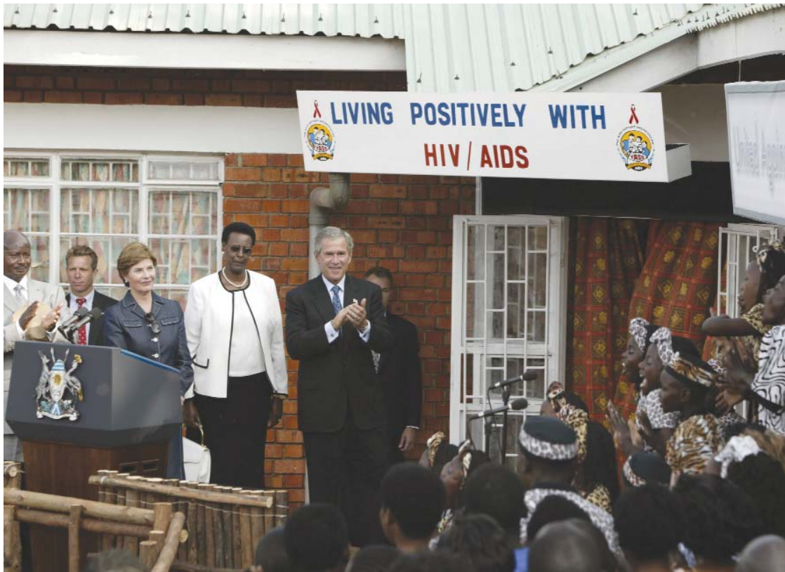
President George W. Bush and Mrs. Bush and President and Mrs. Museveni applaud the singing of the Watoto Choir at the TASO Centre in Entebbe, Uganda, July 11, 2003.