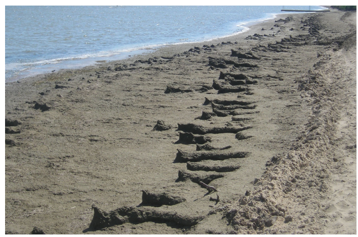
Cladophora "muck" along shore line of Saginaw Bay, Lake Huron. September 2006.

Cladophora blooms have been found in various areas of the Great Lakes, including western Lake Michigan and the Saginaw Bay area of Lake Huron in Michigan. Cladophora mats wash up on shorelines from the bottom of water bodies in the summer months and can be considered a nuisance to local communities. Cladophora blooms create a "muck" zone on beaches and have the potential of harboring bacteria, but do not produce algal toxins.