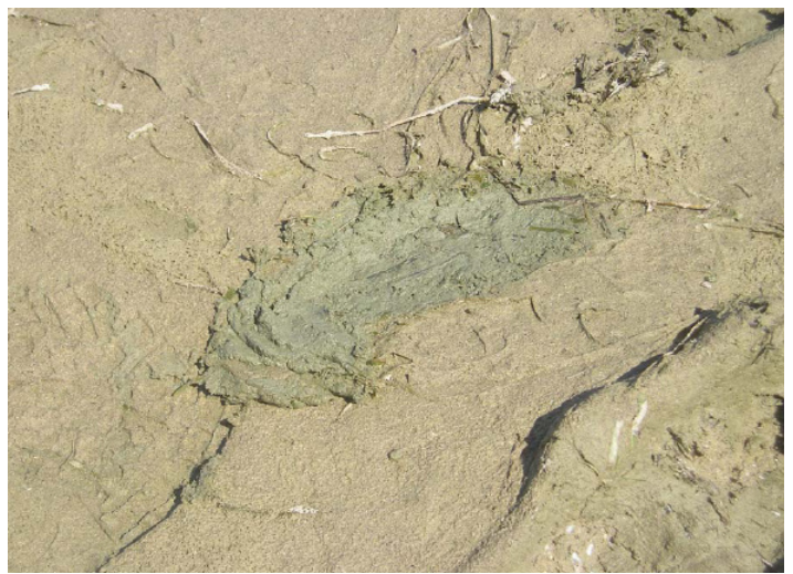
Lake Michigan Microcystis bloom in Muskegon, Michi- Cladophora "muck" along shore line of Saginaw Bay,

Cladophora blooms have been found in various areas of the Great Lakes, including western Lake Michigan and the Saginaw Bay area of Lake Huron in Michigan. Cladophora mats wash up on shorelines from the bottom of water bodies in the summer months and can be considered a nuisance to local communities. Cladophora blooms create a "muck" zone on beaches and have the potential of harboring bacteria, but do not produce algal toxins.