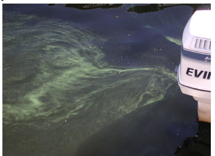
gan. August 2006. Photo courtesy of R. Sturtevant, Great Lakes Sea Lake Huron. September 2006. Photo courtesy of J. Dyble, Grant Network.

Microcystis blooms are suspended in surface water and can give water a green appearance. Microcystis blooms have been found in western Lake Erie, Saginaw Bay and inland tributaries of Lake Michigan. They do not typically wash up on shorelines or leave a slimy residue on shores or boats, but have the capability of producing the toxin microcystin, which poses potential health threats. The toxin may be present in the water even after the bloom subsides.