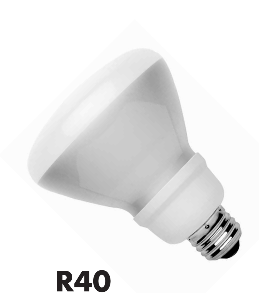
Similar look and light output as a 85 Watt incandescent R40 reflector flood. UL listed for wet locations. Suitable for indoor and outdoor use.