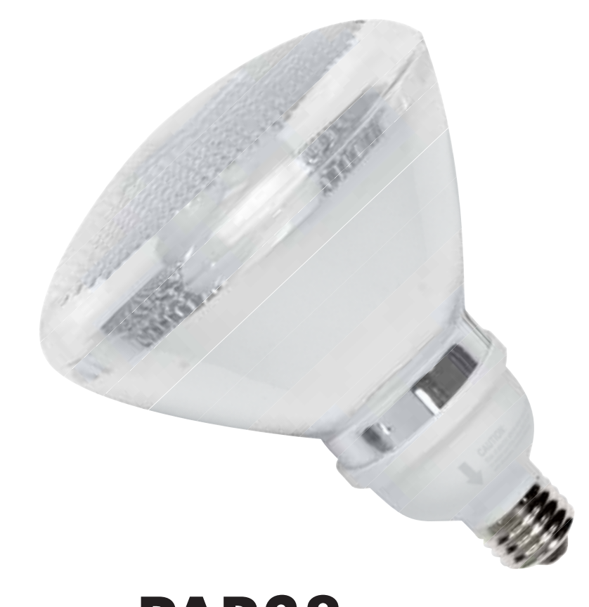
PAR38 Similar look and light output as a 90 Watt incandescent PAR38 reflector flood. UL listed for wet locations. Suitable for indoor and outdoor use.