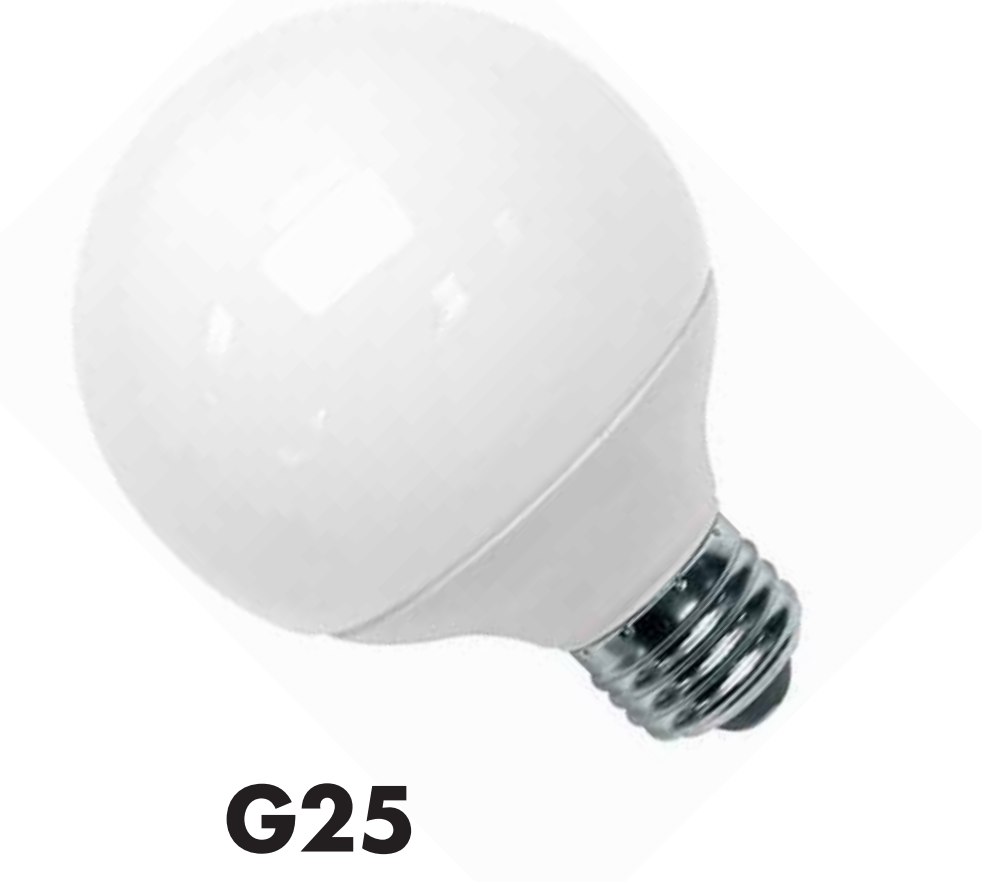
G25 Popular globe shape - can be used anywhere a decorative look is desired. UL listed for wet locations. Suitable for indoor and outdoor use.