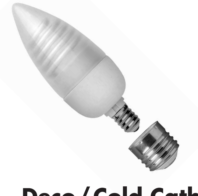
Deco/Cold Cathode The Cold Cathode Fluorescent Lamp (CCFL) is an energy saving alternative to an incandescent deco lamp. UL listed for wet locations. Suitable for indoor and outdoor use.