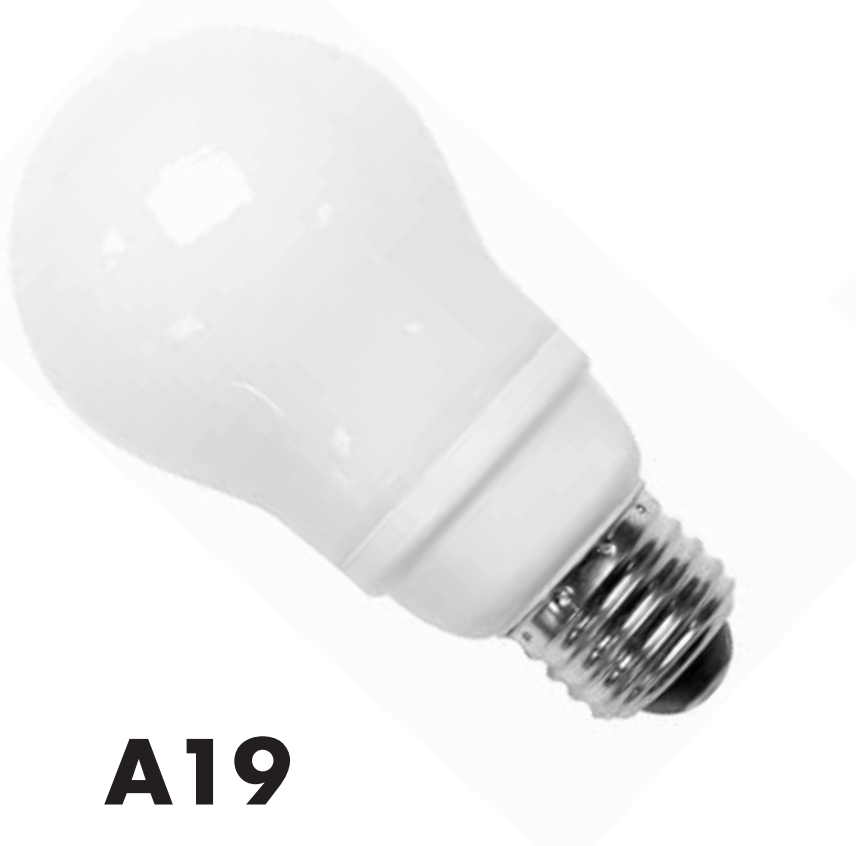
Direct replacement for incandescent, offering energy savings, high color rendering and long life. UL listed for wet locations. Suitable for indoor and outdoor use.