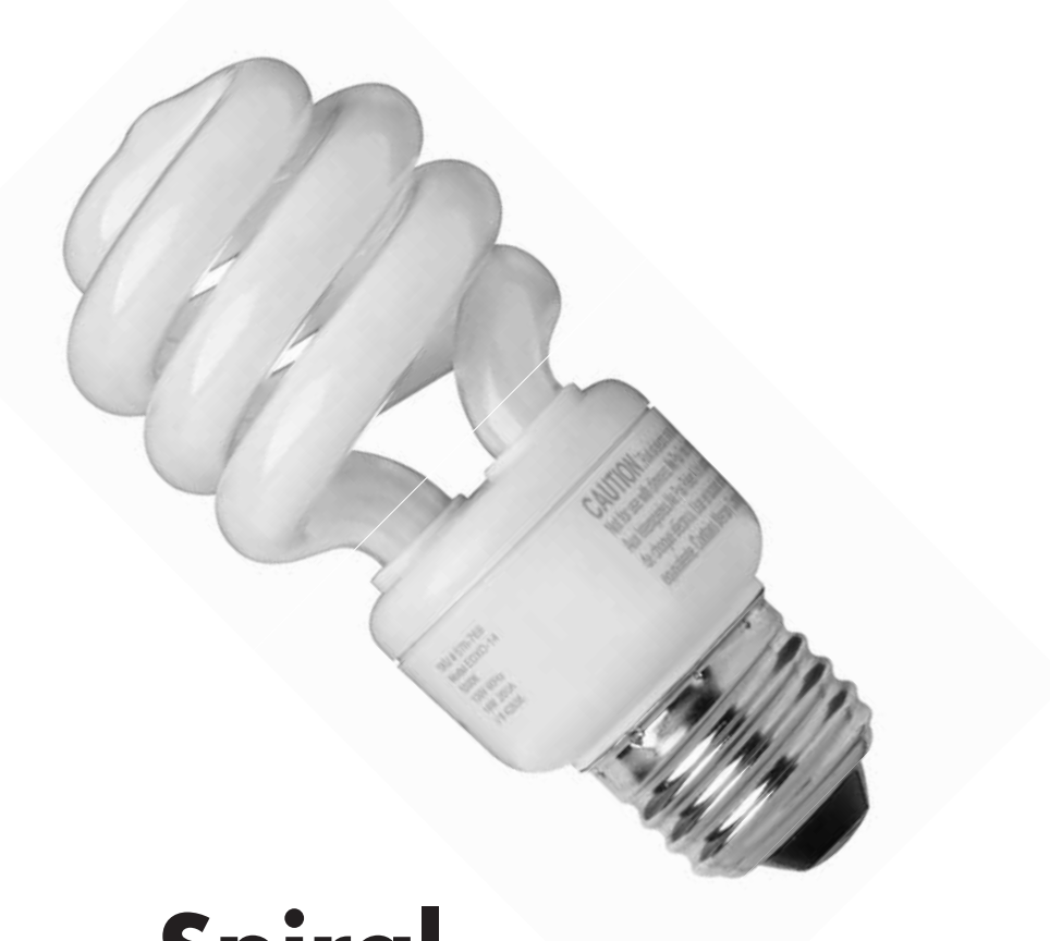
Spiral Energy savings - saves up to 75% in electricity cost compared to incandescent lamps. Ideal for uses in table lamps and sconces or other general lighting applications.

180 Number of kilowatt-hours, over 10,000 hours, used by a CFL.