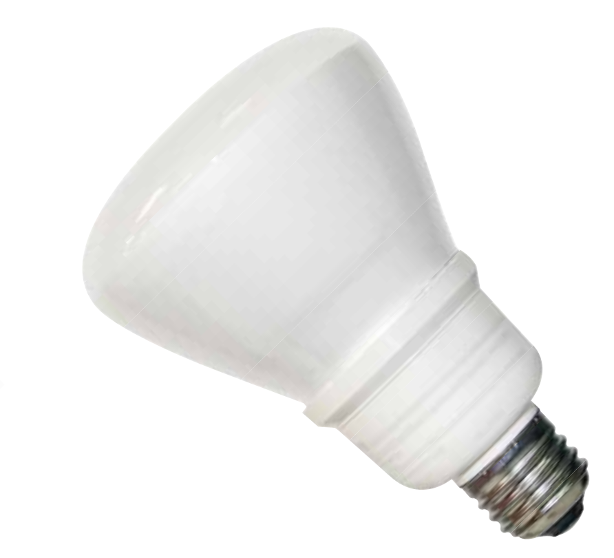
R30 Similar look and light output as a 65 Watt incandescent R30 reflector flood. UL listed for wet locations. Suitable for indoor and outdoor use.