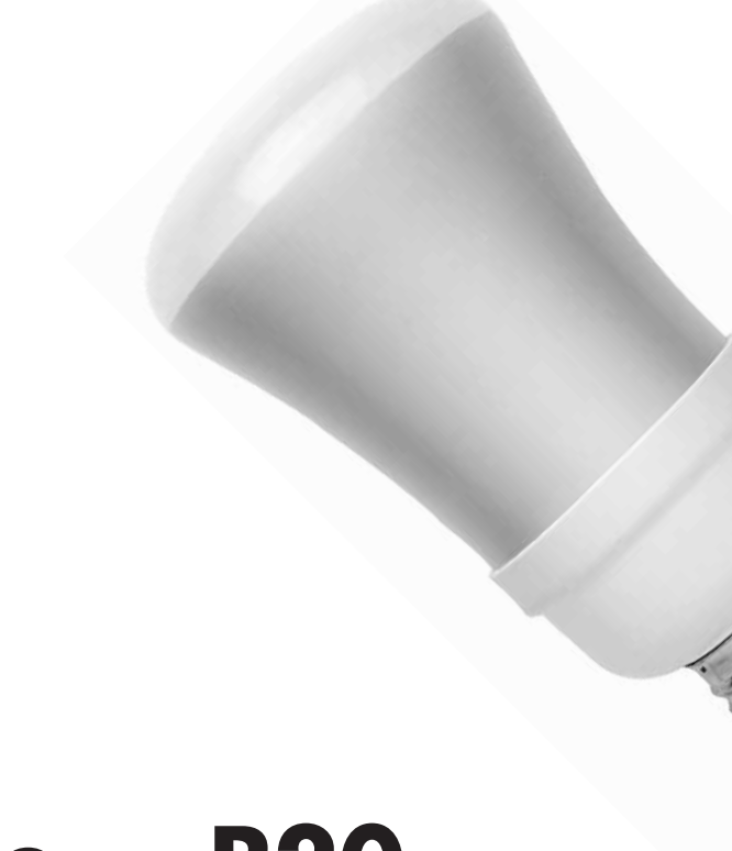
R20 Similar look and light output as a 50 Watt incandescent R20 reflector flood. UL listed for wet locations. Suitable for indoor and outdoor use.