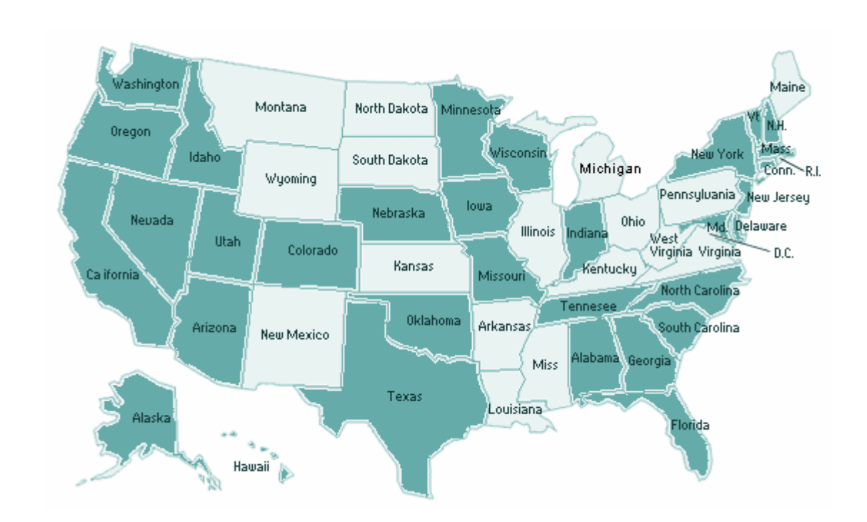
Figure 1. States with Active ENERGY STAR Sponsors in 2006