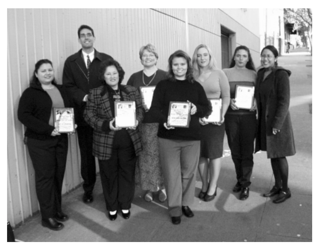
At the Air District's January 17 Board Meeting, representatives of the following Spare the Air 2000 award winners received recognition for their exemplary air quality programs: (left to right) the City of Livermore, the City & County of San Francisco, the City of San Jose, Santa Clara Family Health Plan, Intel, Sandia National Labs, and the City of Milpitas.

At the Air District, it will be our job to mitigate this negative impact, and make sure its consequences last no longer than this blackout season and the energy crisis itself.