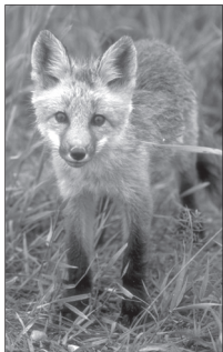
Red Fox

Coyote, sometimes referred to as a "brush wolf", look like a medium-sized dog and are gray or reddish gray, with rusty legs, feet, and ears. Throat and belly are white color. Five to ten pups are born in April. Since the gray wolf became established, coyote numbers have declined and are rarely observed.