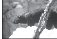
Fisher ( D. Licht )

White-tailed deer are one of the more commonly observed animals on the refuge. Annual deer population ranges from 1,000 to 3,500 deer on Agassiz and the three adjoining state wildlife management areas. Look for deer in all types of habitats. Fawns are born in late May or June.