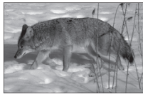
Coyote

Mink may be observed in any of the wetlands. Mink and otters look similar, except mink are smaller in size and have a hairy, bushy tail. In the winter, mink feed almost exclusively on muskrat.