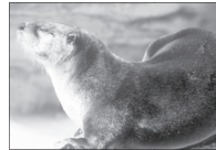
River Otter ( D. Licht )

Fisher, a tree dwelling weasel larger than the ground living weasel species, is about the size of a red fox. Pine marten, a close relative to the fisher, is smaller and lives in the coniferous forest of Minnesota. Color of the fisher is dark brown, almost black, with a grizzled appearance caused by white bands on the guard hairs. The tail is long, hairy and bushy. One to four young are born in late March or early April. Although fisher have lived on the refuge for many years, the first documentation of fisher born on the refuge was in June of 1993. Fishers are solitary, except during mating and when rearing their young. Fishers live mainly in the hardwood forest and are rarely observed.