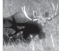
Bull Moose