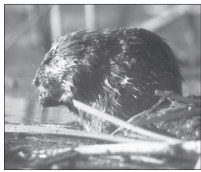
Muskrat