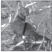
Mink (D. Engler)

Muskrat begin building houses in September out of cattail, bulrush, and other wetland vegetation. Their houses provide loafing and resting sites to Canada geese and ducks which nest on top of muskrat houses.