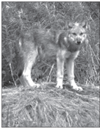
Gray Wolf