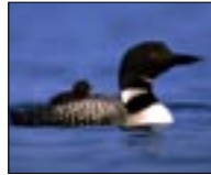
Loon and Chick

At Seney, the trumpeter swan is a true success story. In 1991 and 1992 captive-reared swans were released. Excellent habitat and food sources have allowed the swans to flourish. Today trumpeter swans, the largest North American waterfowl, are a common sight on the refuge.