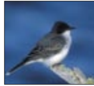
Eastern Kingbird

The refuge's many species of songbirds are some of the last to arrive. By the end of May, birdwatchers will be delighted with the variety of birds. The best time to listen for birds is late May to early June.