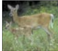
Doe and Fawn R. Denomme

Wildlife abounds in the refuge's forests, marshes, pools, creeks, rivers, and bogs. Wildlife enthusiasts may see beaver, river otter, white-tailed deer, black bear, coyote, fox, muskrat, mink, snapping and painted turtles, frogs, and insects. Patience and knowing where to look for these creatures is key to seeing them. Refuge staff and volunteers at the visitor center will gladly provide you with helpful wildlife watching tips.