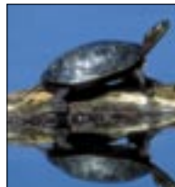
Painted Turtle K. Sommerer

Wildlife abounds in the refuge's forests, marshes, pools, creeks, rivers, and bogs. Wildlife enthusiasts may see beaver, river otter, white-tailed deer, black bear, coyote, fox, muskrat, mink, snapping and painted turtles, frogs, and insects. Patience and knowing where to look for these creatures is key to seeing them. Refuge staff and volunteers at the visitor center will gladly provide you with helpful wildlife watching tips.