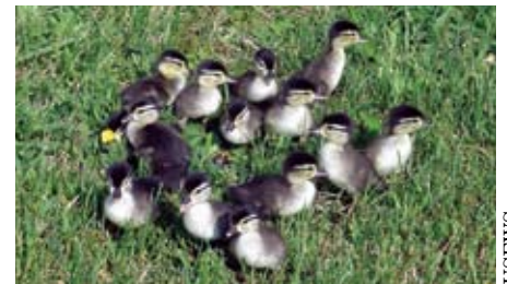
Newly hatched wood ducks