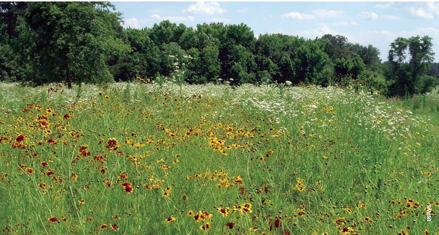
Wilna grassland with flowers

Shorebirds, neotropical migrant songbirds, raptors, and marsh birds rely on the Rappahannock River's corridors during the spring and fall migration periods. With help from partners and volunteers, refuge staff are restoring native grasslands and riparian forests along the river and tributary streams to provide additional habitat for these species. Focus species and species groups for management include bald eagles, forest-interior dwelling species such as wood thrush and Acadian flycatcher, and grassland nesting birds such as grasshopper sparrow and northern bobwhite.