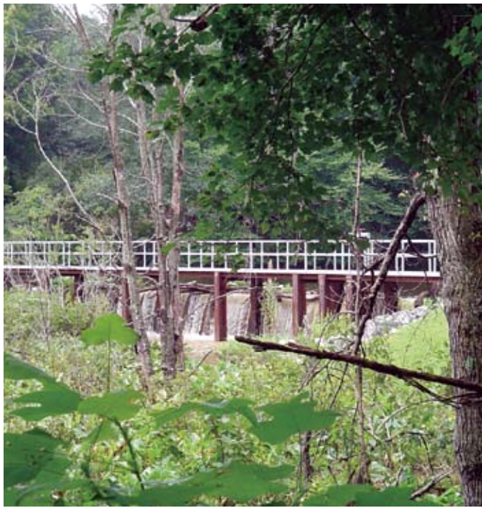
Wilna pond levee