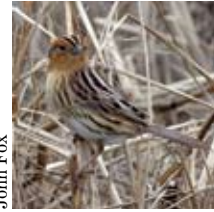
Right: Le Conte's sparrow Far right: Viceroy