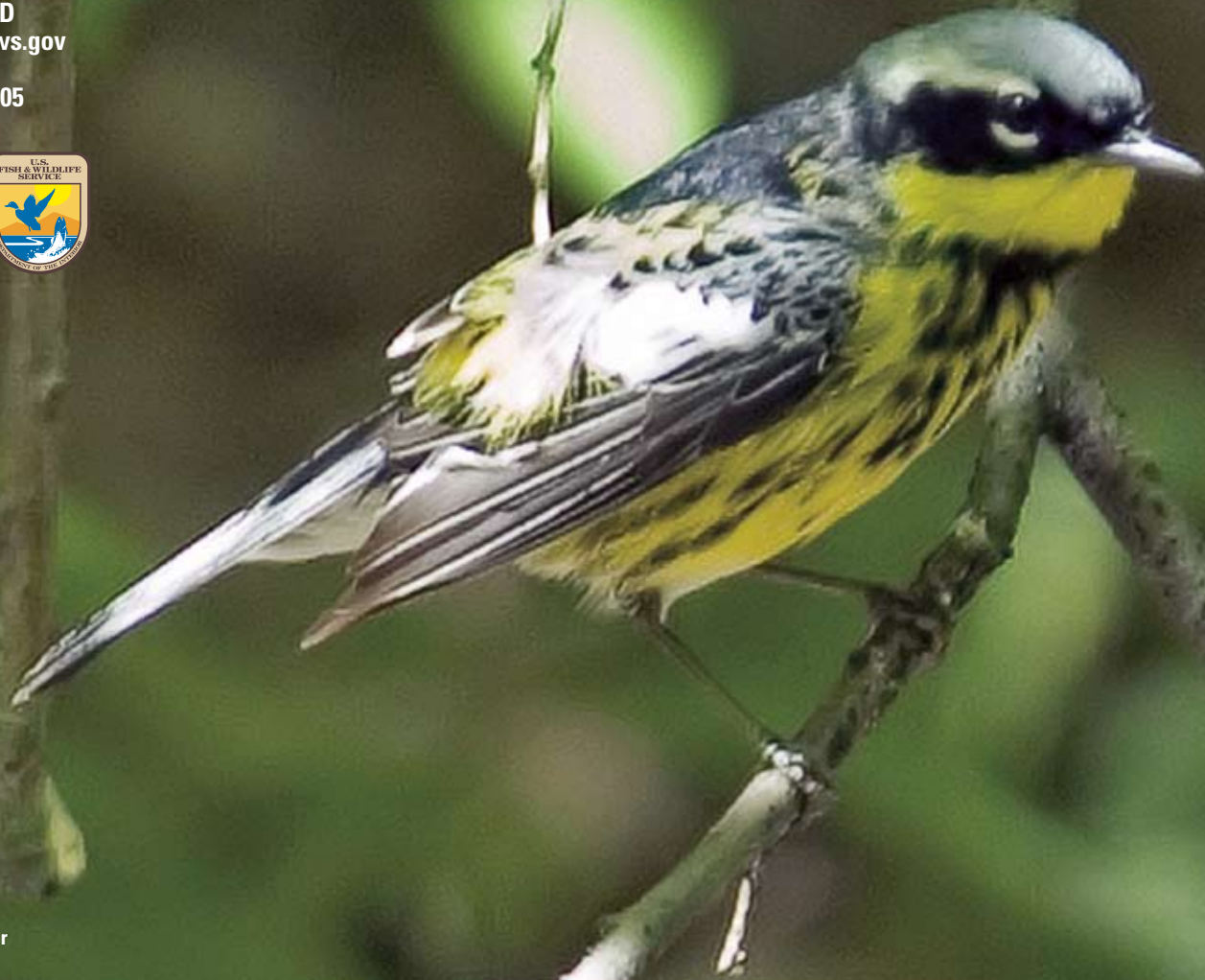
Magnolia Warbler Clifford Otto