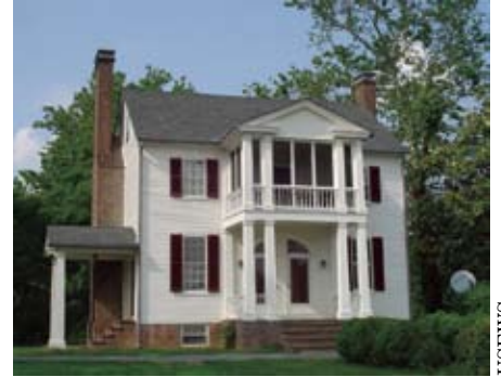
Headquarters Wilna House