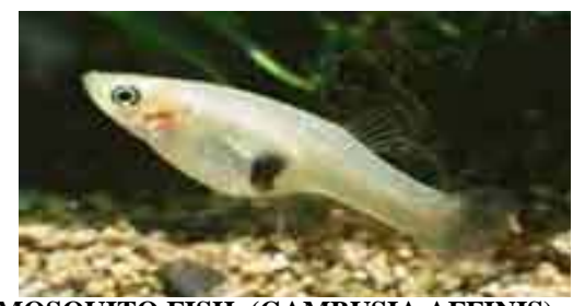
MOSQUITO FISH (GAMBUSIA AFFINIS)