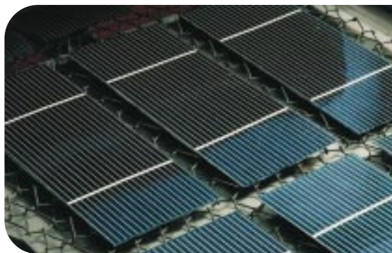
String Ribbon solar cells emerge from a processing furnace

Engelhard's Molecular Gate technology might not have gone forward due to lack of funding. It was considered too preliminary and too high risk despite its potential benefits. ATP support enabled the development of this promising technology, and provided the means for Engelhard to partner with universities possessing the special scientific and engineering expertise needed to bring Molecular Gate technology to fruition.