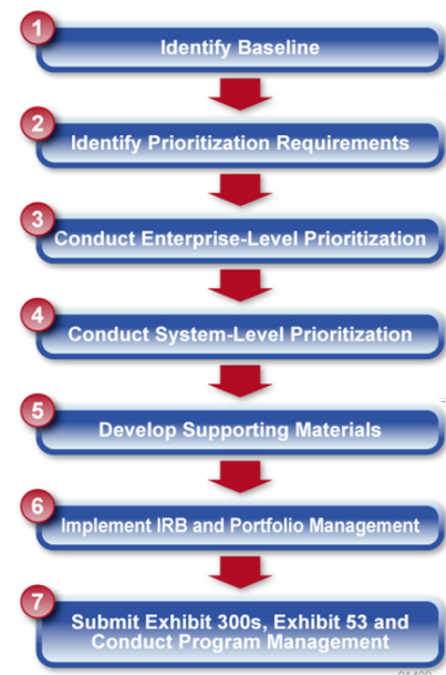
FIGURE 1 Integrating IT Security and Capital Planning