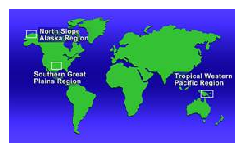
Figure 1. Locations of ARM Fixed Sites.

The ACRF permanent research sites represent three different climatic regimes: (1) the Southern Great Plains (SGP), (2) North Slope of Alaska (NSA), and (3) Tropical Western Pacific (TWP). Respectively, these sites address a range of climatic conditions: (1) variable mid-latitude climate conditions, (2) land and land-sea-ice arctic climate, and (3) the tropical warm pool in the western Pacific Ocean. In addition, an ARM Mobile Facility (AMF) is being developed for short-term deployment (approximately 1 year) at future sites to be determined by the ACRF Science Board. The locations of the ACRF permanent research sites are shown in Figure 1. Details on the specific nature of each site and the instrumentation at each can be found on the ARM website at <a href="http://www.arm.gov/instruments/">http://www.arm.gov/instruments/</a>.