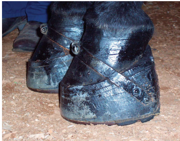
Hooves and pads are measured to ensure compliance with regulations addressing heel:toe ratio and artificial toe-length extension.

The examination for soring consists of three components: an evaluation of the horse's movement, observation of the horse's appearance during the inspection, and physical examination of the horse's forelegs from the knee (carpus) to the hoof. Particular attention is paid to the area of the coronet band, the anterior pastern areas, the "pocket" of the posterior pastern area, and the bulb of the heel, all of which are typical places for the application of soring chemicals. The presence of abnormal tissue, swelling, pain, abrasions, or oozing of blood or serum may indicate soring. Inspectors also measure for shoeing violations and look for training devices that are too heavy or improperly applied. Heavy, rigid devices striking the pastern and coronet band during exercise can cause soring.