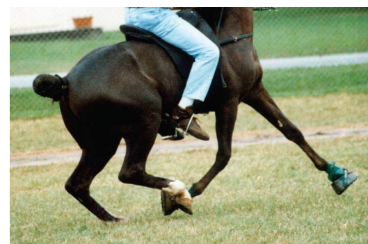
Gait alterations created by soring the forelimbs may result in abnormal stresses in the hind legs.

In the 1950s, some horse owners and trainers who wanted to improve their horses' chances to win at shows used soring as an unfair shortcut to conventional training methods. Because sored horses gained a competitive edge, the practice became popular and widespread in the 1960s. Public outcry over this abusive practice led to the Horse Protection Act, which Congress passed in 1970 and amended in 1976.