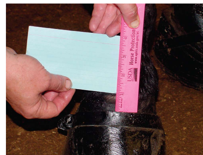
Careful measurements are done to ensure that metal hoof bands are in compliance with the regulations.

Responsibility for preventing sored horses from being exhibited, shown, or sold rests with owners, riders, sellers, trainers, and managers of these events. Owners and trainers benefit if a horse wins a show or sells for a high price, thus leading to greater incentive to sore the horse. Event managers, however, have the major legal responsibility to exclude or disqualify sored horses at their auctions, exhibitions, sales, or shows.